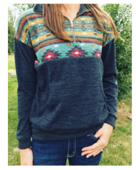
Tribal Sweater.

5. Tribal: This pattern screams fall. It's usually seen on cardigans, or over-sized sweaters, and it's a print that can be dressed up or down depending on the occasion.