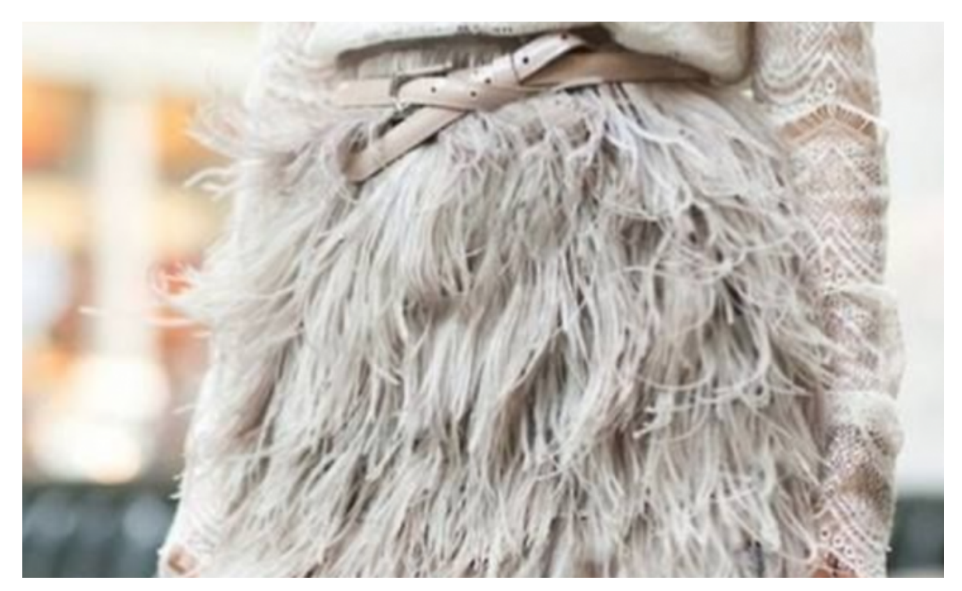
Feather Skirt

Get fun and flirty with an ostrich feather skirt, recently made popular by the new fashion trends for 2019. This is a great piece to have in your wardrobe because it can be dressed up or down. Not only is it eye-catching, but it goes great with a cashmere sweater or a blazer.