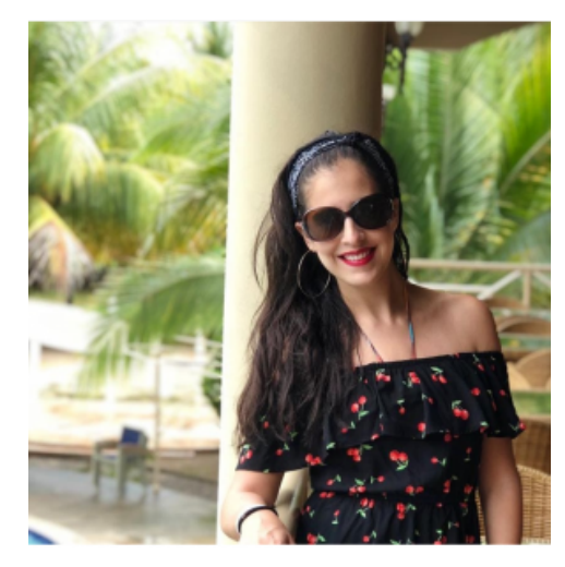
Cherry Dress.

3. Cherries: This print would be best for something more casual, like going to a movie or low-key happy hour. It is super fun and playful. You'll definitely make a statement in this fruity pattern.