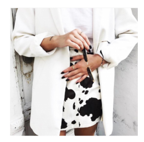
Cow Print Skirt

1. Cow Print: The splotchy black and white pattern is making a big come-back. This bold print can easily be paired with solid pieces, making it look classy instead of tacky.