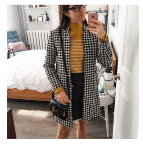
Houndstooth jacket.

2. Hounds-tooth: Honestly, this pattern is classic and timeless. Start adding small pieces to your closet that you can incorporate into an everyday look.