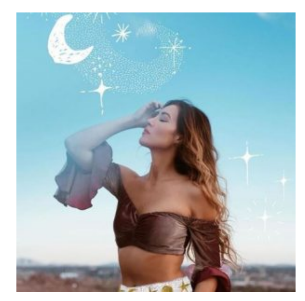
Bandeau top.

bandeau will keep you comfortable and ready to enjoy the day!