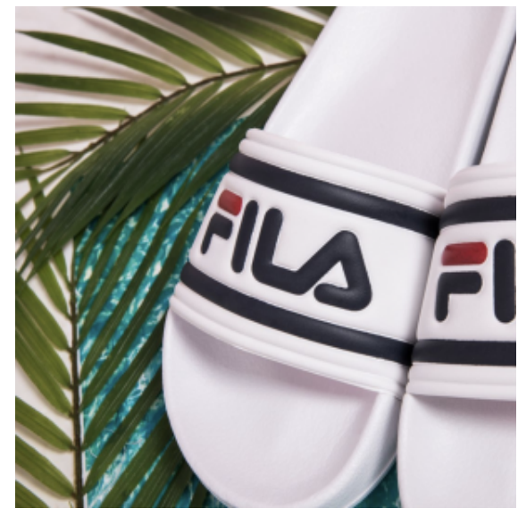
Pool Slides.

3. Pool Slides: If you're looking for a really easy ugly-cute sandal option, then pool slides are perfect for you. You can slip them on whenever you please and instantly have a look that says, "I'm ready for the beach!"