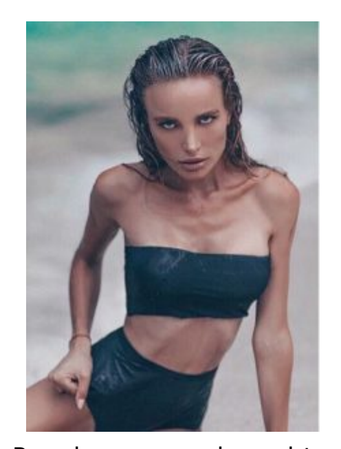
Bandeau swimsuit.

Related Link: Best East Coast Beaches for Summer 2018