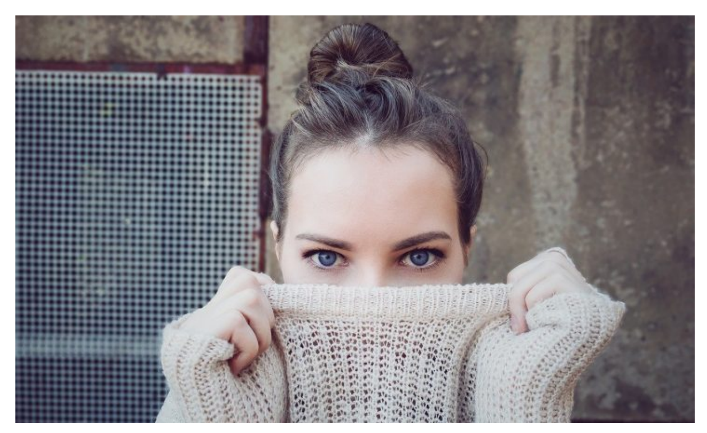
By Hope Ankney

We've officially made it to the Holiday season! And, of course, with the Holiday season comes colder weather, hotter drinks, lots of tinsel, and a different level of <u>fashion</u>. Besides the copious number of scarves that seem to never go out of style, <u>fashion trends</u> come and go during this time of year. With office work parties, family get-togethers, and seasonally themed events with friends dominating your social life, it's easy to get overwhelmed with what to wear as the holidays approach. 2019 fashion tips look to lean heavily on the traditional pantsuit and even more rambunctious dresses. So, if you're scrambling for new ideas to fit into your wardrobe, now's the time to make a statement.