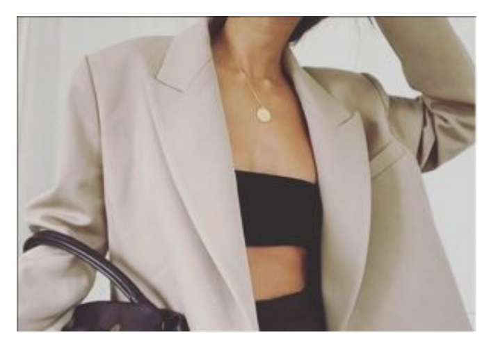
Bandeau top with cover.

1. Covers are cool: A light cover or sheer top can only make your outfit even more charming. Because bandeaus come in so many different colors that picking a color that is incorporated in your top will allow you to pop out more. Using the bandeau as an accessory helps when you don't want to wear it by itself or when weather plays a factor in your outfit. The diversity of the bandeau allows for you to layer up if needed. This dress up or dress down accessory is great for the summer, spring or fall.