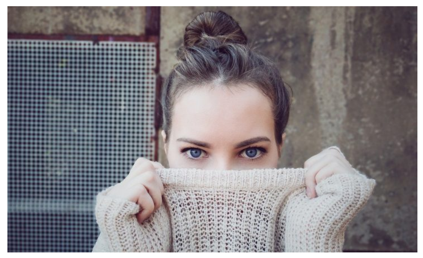
By <u>Mara Miller</u>

Do you remember the classic scene with Audrey Hepburn and the beautiful pearl necklace she wore in Breakfast at Tiffany's ? Whenever you think of pearls as an accessory, a necklace or delicate earrings usually come to mind. 2019 brings a few new takes on this classy jewel! We've gathered some of them up for you to try.