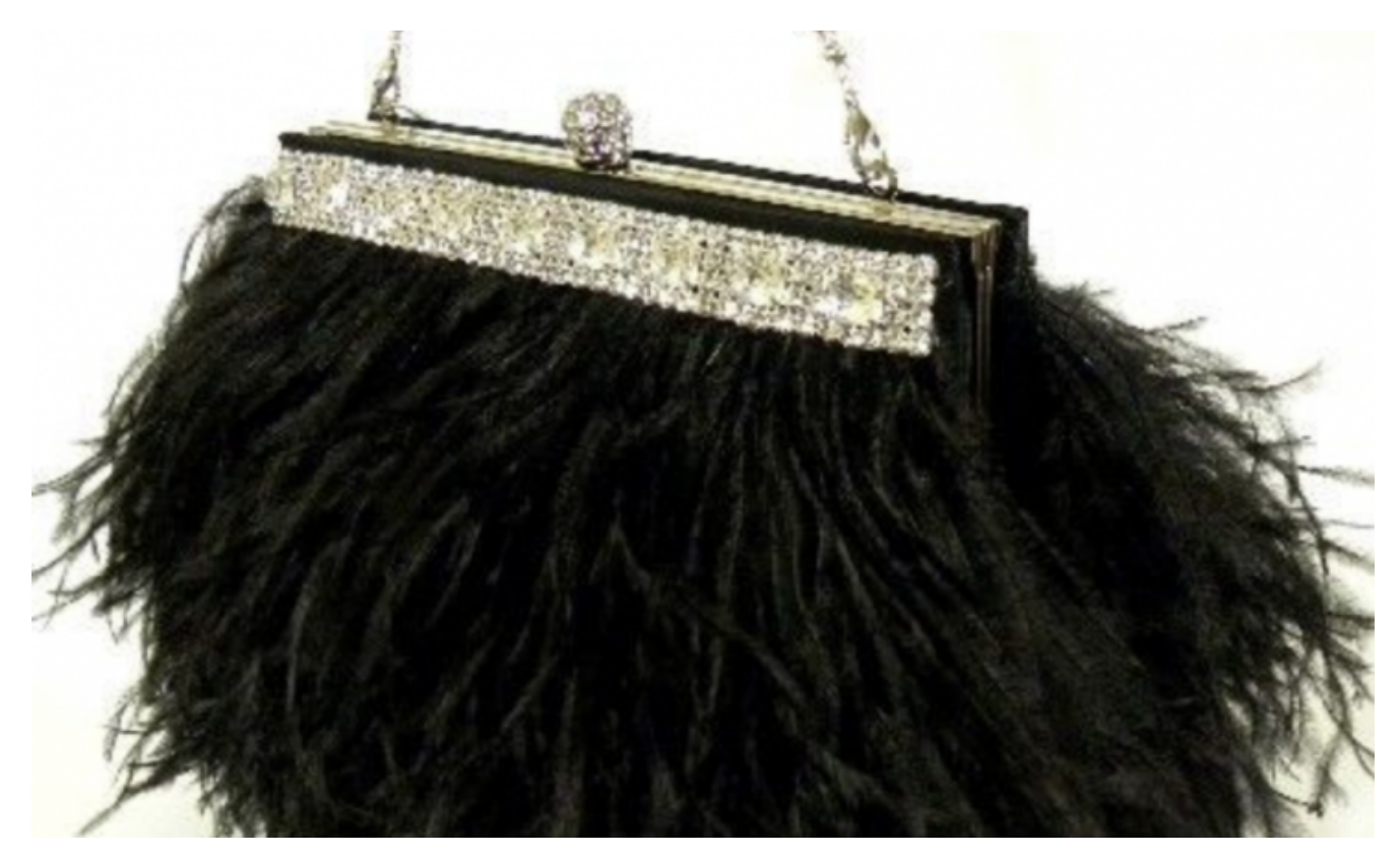
Feather Purse

We all need to be practical sometimes, right? Why not grab a clutch surrounded in ostrich feathers for your next date night? Or if you're the type of girl who has to shove everything into her bag, find a full-sized purse! It can either be covered in feathers or decorated along the trim of the opening of the bag, whatever strikes your fancy while you're shopping for your next carry-all accessory.