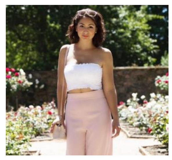
Bandeau with high-waisted

Related Link: <u>Fashion Trends: 5 Best Ways to Wear Your</u> <u>Favorite Spring-Time Dress</u>