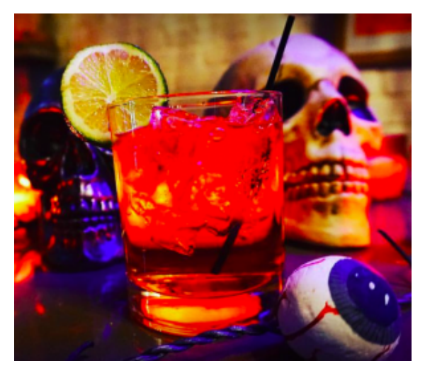
This is Halloween drink.

This Is Halloween: Have a glass of pure fright! This drink is a mix of Pumpkin Liqueur, sour apple pucker, apple cider, and fireball. This drink will surprise you with all it's fall flavors.