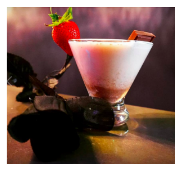
The Chocolate Factory Martini.

The Chocolate Factory Martini: Try a sip of rich and creamy drink that will make you feel like a kid again! This remake of a kid-like treat is mixed with Dorda chocolate liqueur, creme de cocoa, cream, and Vanilla vodka. It's not purely your imagination, this drink is delicious as it looks!