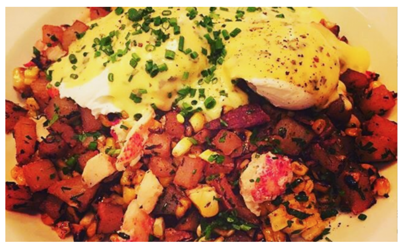
Rue 57 Lobster dish.

serving up superb flavor and a luxurious atmosphere for every meal of the day!