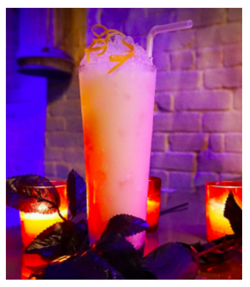
The Jack Skellington drink.

Related Link: Famous Restaurants: NYC's Most Popular Hidden <u>Restaurants</u>