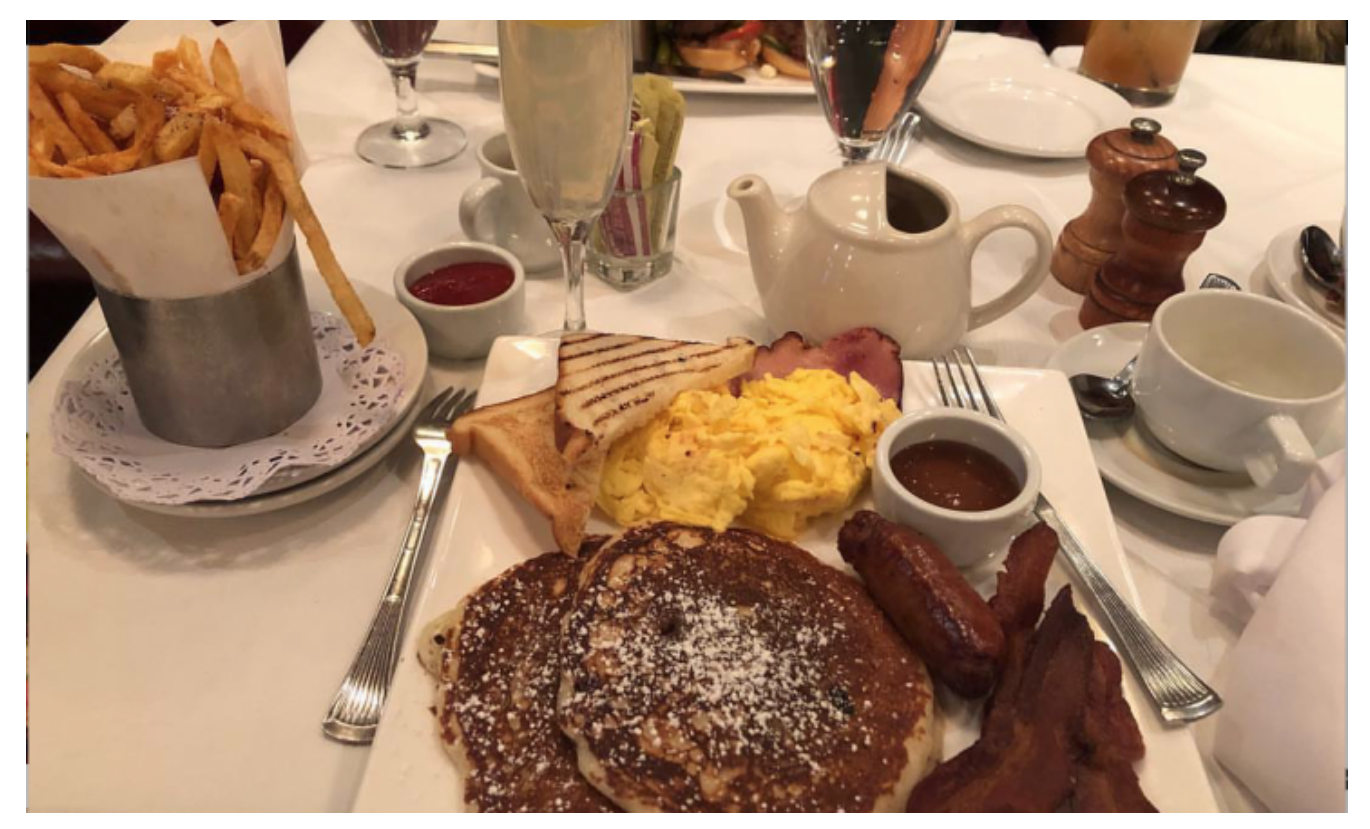
Rue 57 NYC Brunch.

Rue 57 in New York City is great for brunch, lunch, and dinner. Essentially, if you're in NYC and looking for a great atmosphere with steller service and amazing food, look no further than Rue 57. You can find them on their website https://rue57.com/, or through social media on Facebook and Instagram.