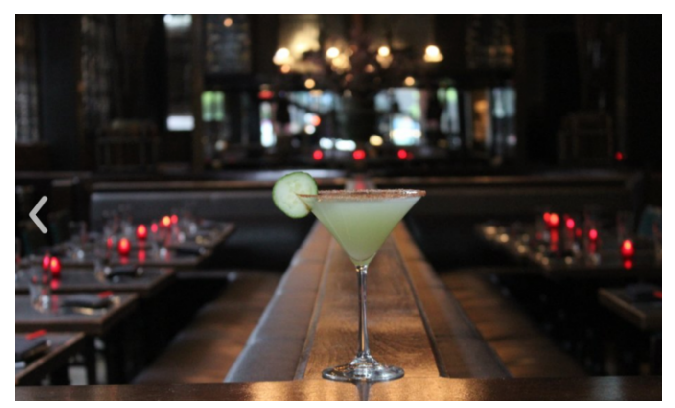
Rue 57 NYC Beautiful Dining Hall.

Not only does Rue 57 offer a beautiful environment with succulent food, but their bottomless brunches keep the customers coming back for more. Their menu is bound to meet your taste bud's desires ranging from burgers and steaks, to seafood and incredible sushi. All of this served by their friendly and attentive staff makes it one restaurant you will not want to miss the next time you're visiting New York City.