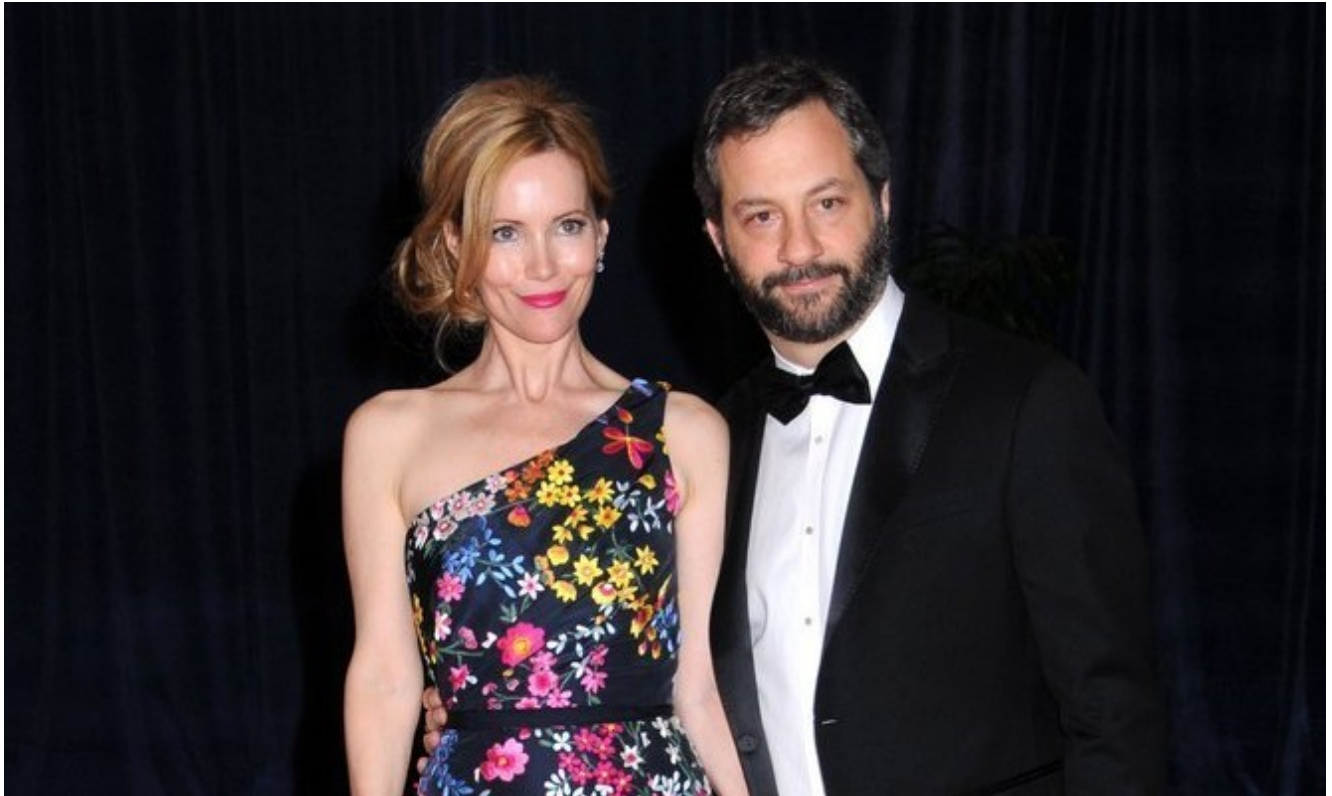
Leslie Mann and Judd Apatow

The hilarious actress and her film producer husband met on the set of 'The Cable Guy' in 1996 and were married a year later. Since then, this celebrity couple has worked together on a number of comedies, including 'The 40 Year Old Virgin' and 'Funny People.'