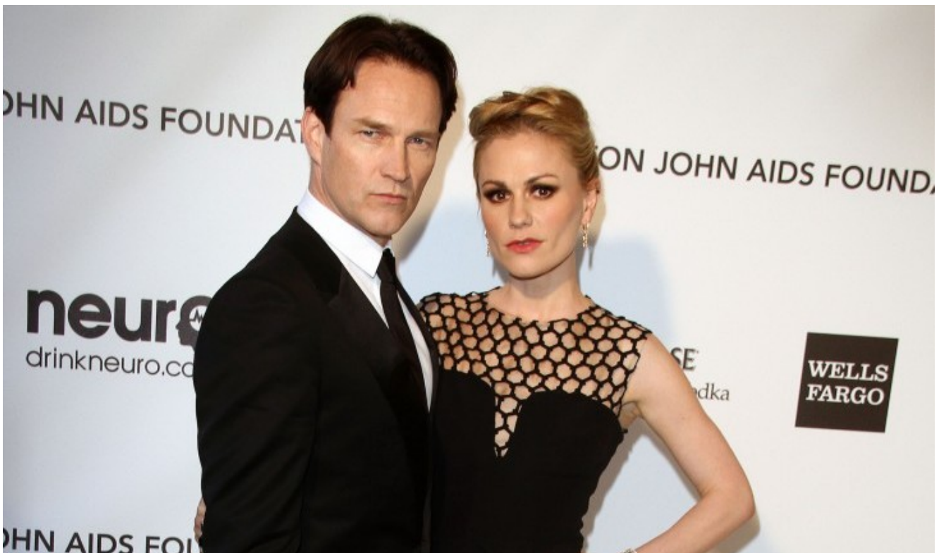
Stephen Moyer and Anna Paquin

These sexy stars of 'True Blood' wed in 2010, paying no