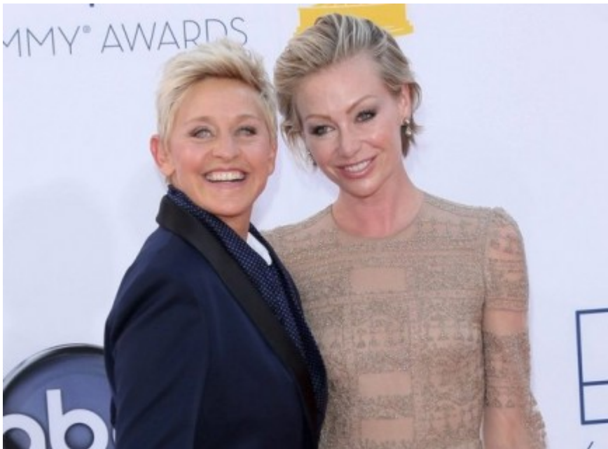
Ellen DeGeneres and Portia de Rossi

Both of these lovely ladies have written books that give insight into the struggles they've had to face. The funny lady wrote about coming out in Hollywood and her career as an actress, host, and comedian, while her wife wrote about her