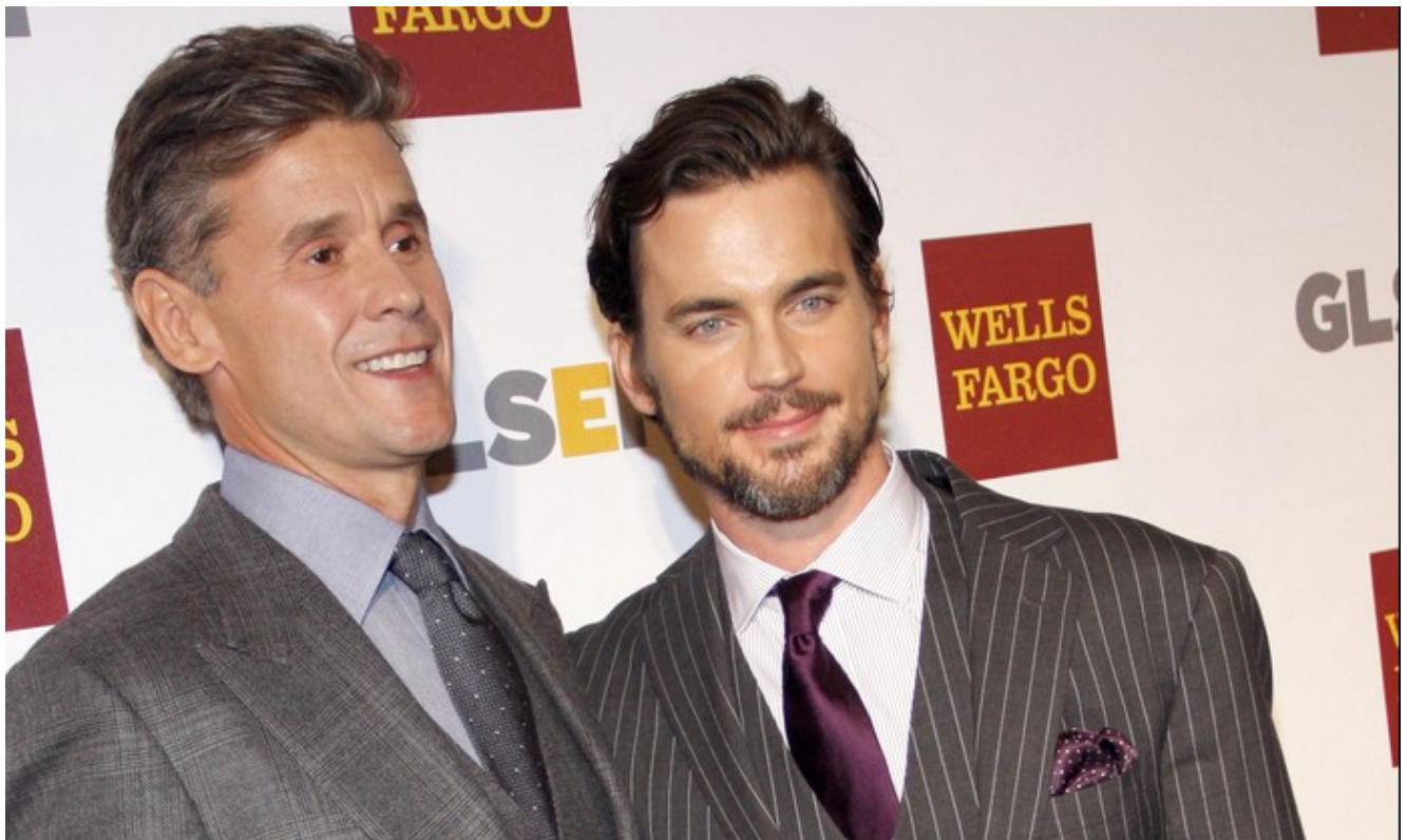
Simon Halls and Matt Bomer

The 'Magic Mike' star married Halls in 2011, a year before the