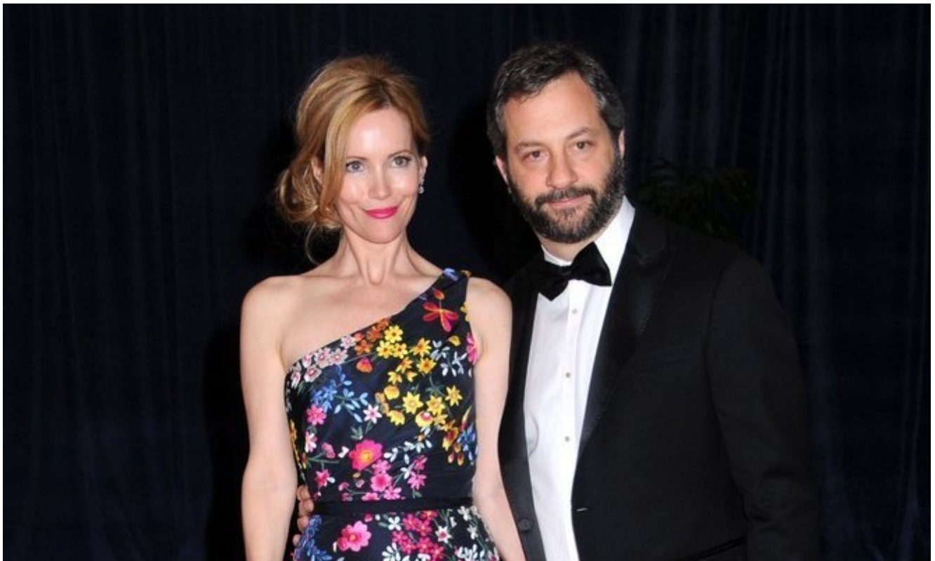
Leslie Mann and Judd Apatow

The hilarious actress and her film producer husband met on the