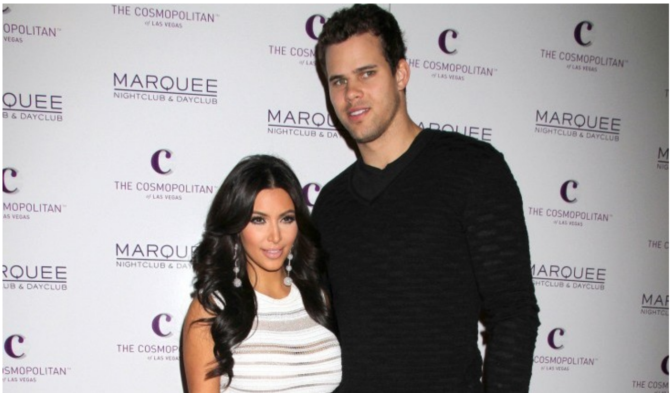
Kim Kardashian and Kris Humphries

This celebrity marriage only lasted 72 days before the famous couple announced their split.