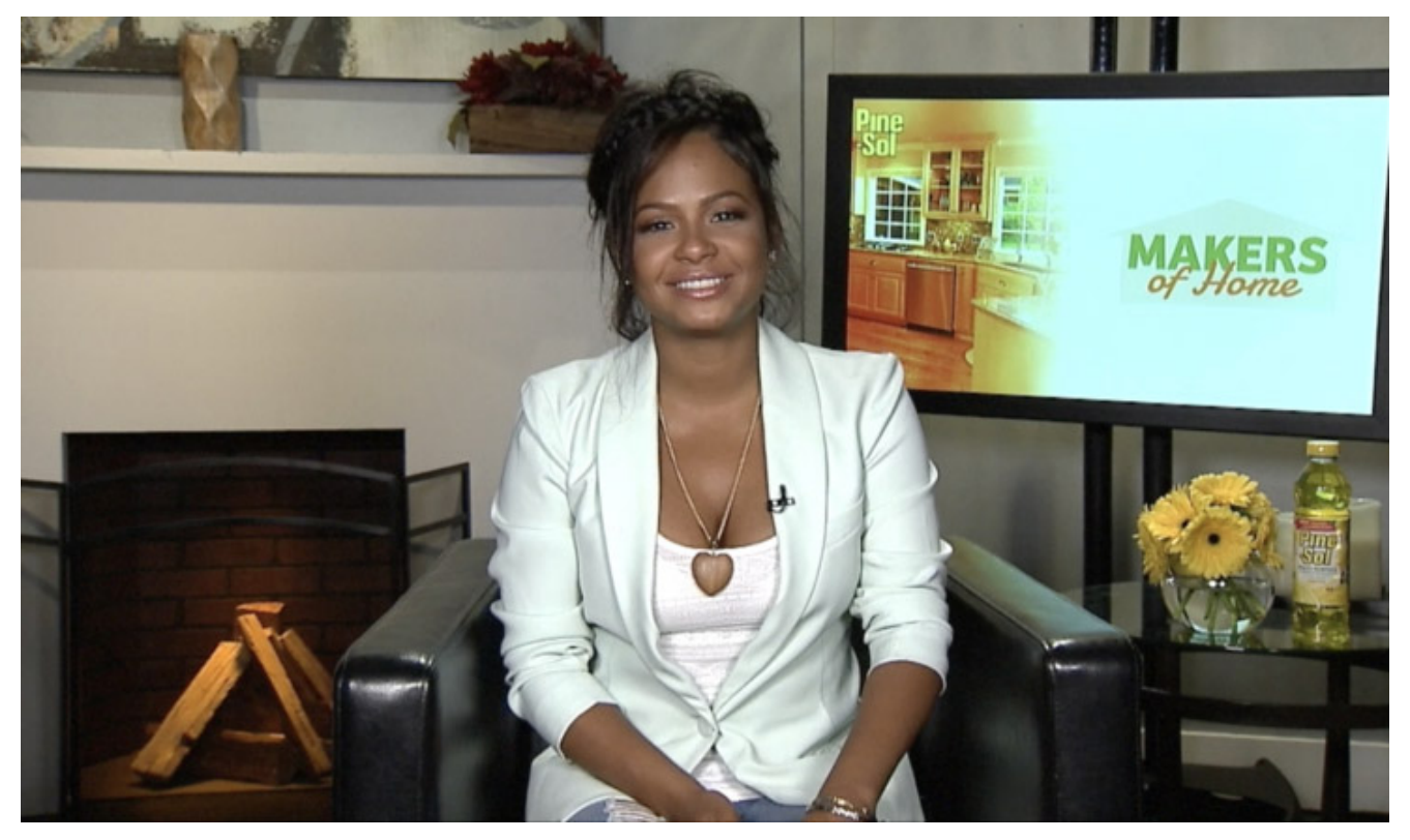
By <u>Cortney Moore</u>

Move over Zumba because a new exercise dance craze is taking over the nation! Make way for twerking yourself into a slimmer shape! Yes, twerking, or as some like to put it, a "twerkout." It's not just for celebrities like Miley Cyrus. These instructional dance classes are popping up in gyms and dance studios across the country. It's where fitness meets the club, combining dancehall choreography, cardio and aerobics to help exercisers break a sweat. Not convinced to give it a try? Well a single 60-minute class can help you burn up to 1,000