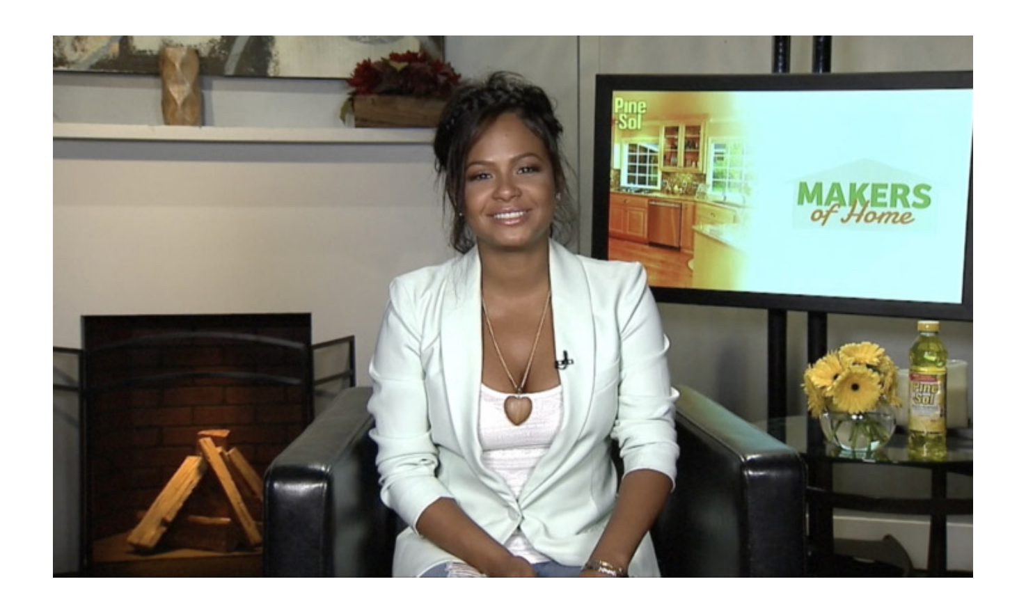
Page 1 of 27