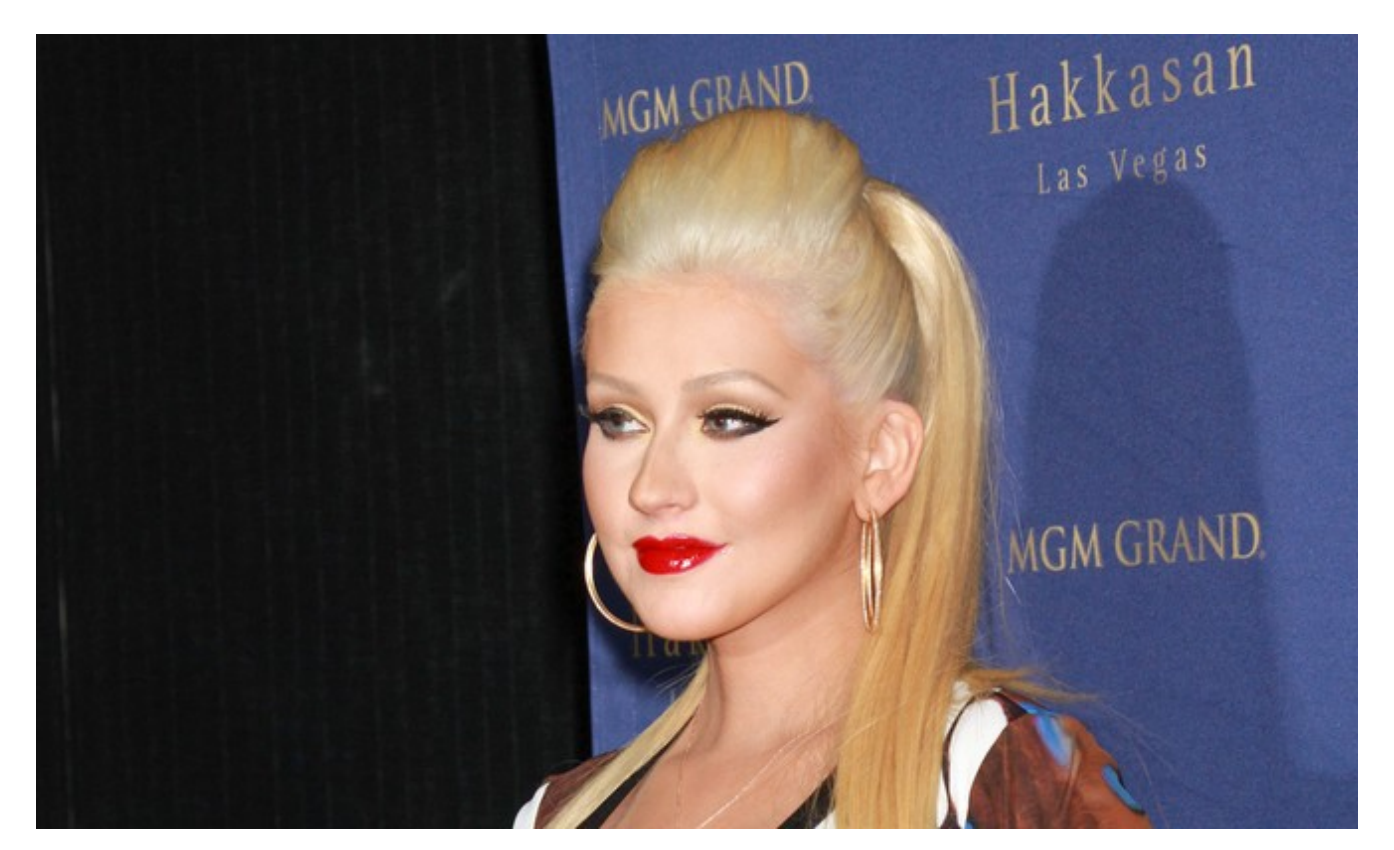
By <u>Katie Gray</u>

Pop stars know how to pop out cute <u>celebrity babies</u>! They're not only good at making music, but they also make beautiful children. Some of these lovely ladies are in <u>celebrity relationships</u> or have had <u>celebrity weddings</u>, while others are going strong as single moms. No matter what their current situation is, one thing is for sure — they all have beautiful celebrity babies!