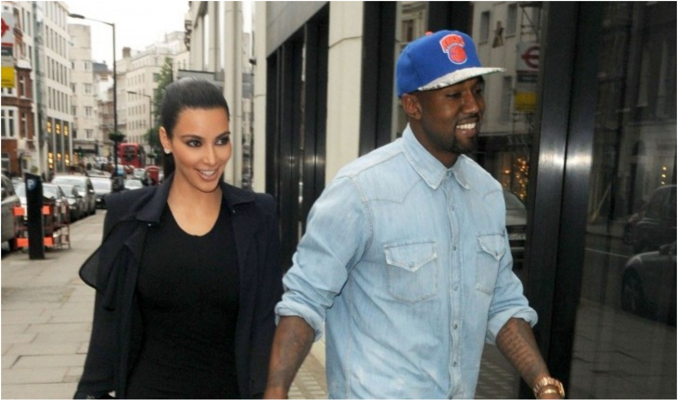
Kim Kardashian West and Kanye West

If diamonds were a meter of love, West's love for the reality TV star is off the charts. The rapper bought his wife a 73,000 dollar Panthere De Cartier cuff embellished with diamonds and emeralds.