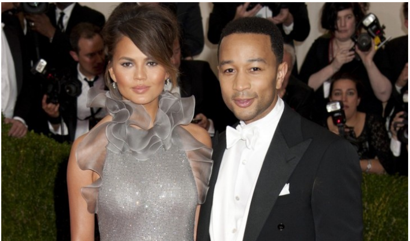
Chrissy Teigen and John Legend

The soulful singer-songwriter and his wife, who has been in the media for her humorous crying face, most recently appeared