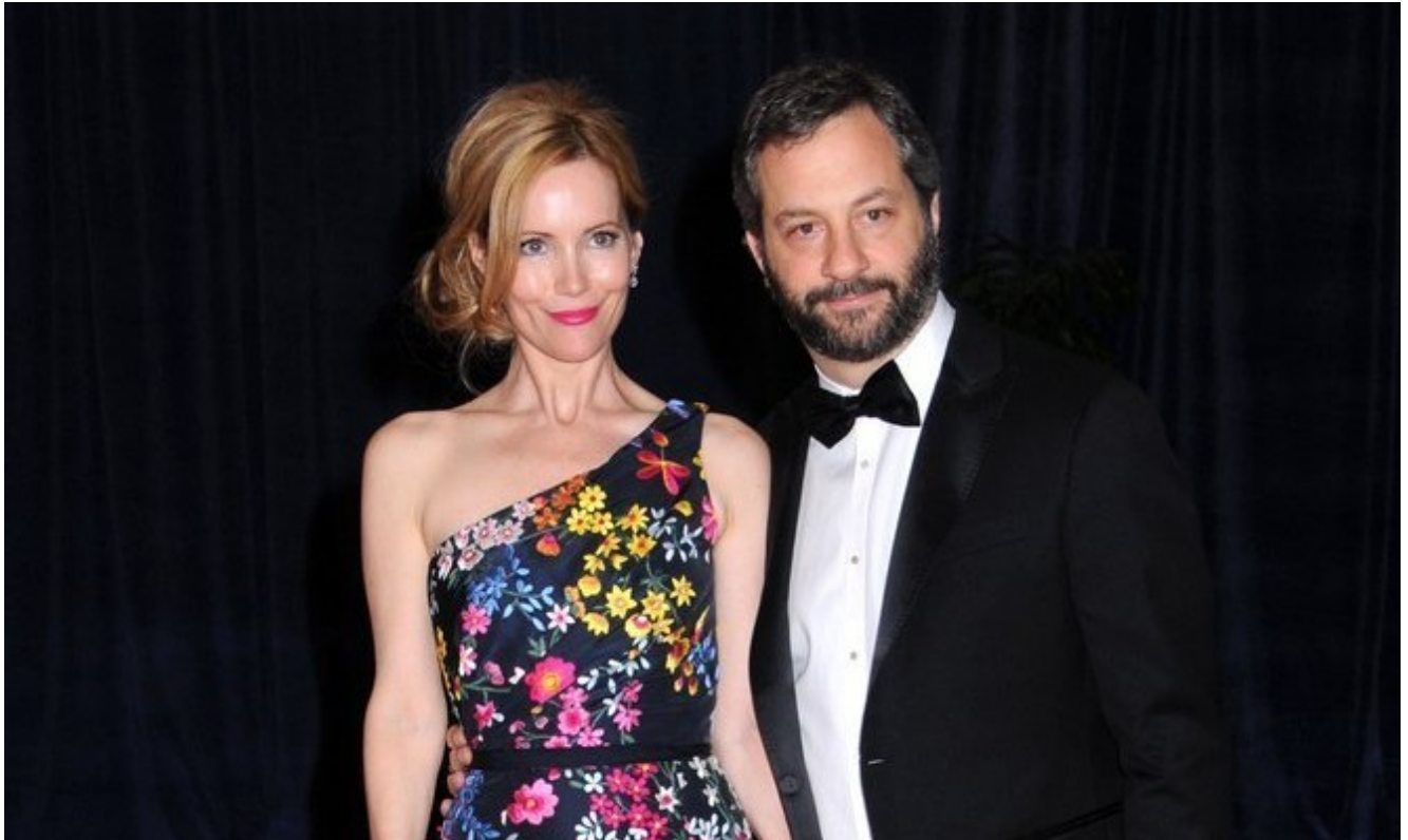
Leslie Mann and Judd Apatow

The hilarious actress and her film producer husband met on the set of 'The Cable Guy' in 1996 and were married a year later. Since then, this celebrity couple has worked together on a number of comedies, including 'The 40 Year Old Virgin' and 'Funny People.'