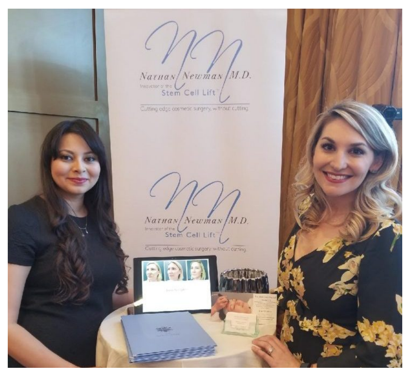
Two ladies showcasing the products and services at the Nathan Newman M.D booth.