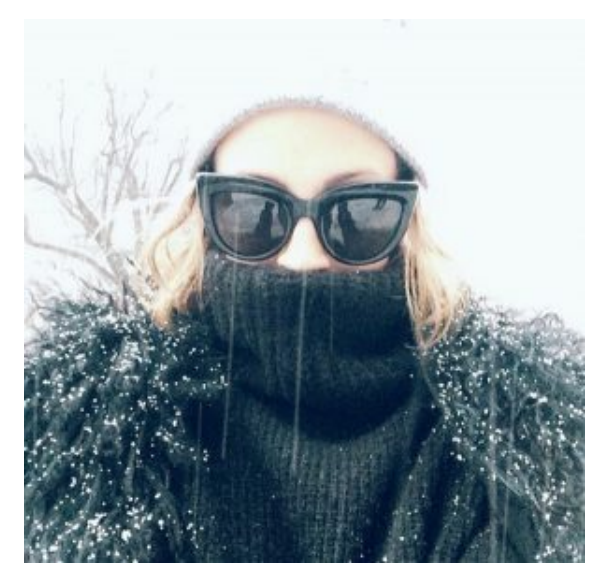
Nicole Richie.

eye sunglasses. People are wearing these types of shades in the style of both big and small. Nicole Richie is always donning some fabulous sunglasses so of course she was wearing some of these.