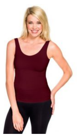
Basic Tank.

Available in over thirty colors, including some mouth watering shades like Pink Lemonade, Kiwi, and Mulberry, this tank is the perfect addition to any wardrobe. Whether it's worn as a base layer or on its own, this tank adds depth to any outfit. Its size perfectly hides bra straps and hits just below the hips for a slimming and lengthening affect. The material prevents slipping and shifting throughout the day, so those constant tugs and adjustments will be a habit from the past. It's the wardrobe solution you didn't know you needed designed by fashion industry veteran Linda Schlesinger. Priced at $34, it's a quality investment in your mother's attire to help her look and feel her best.