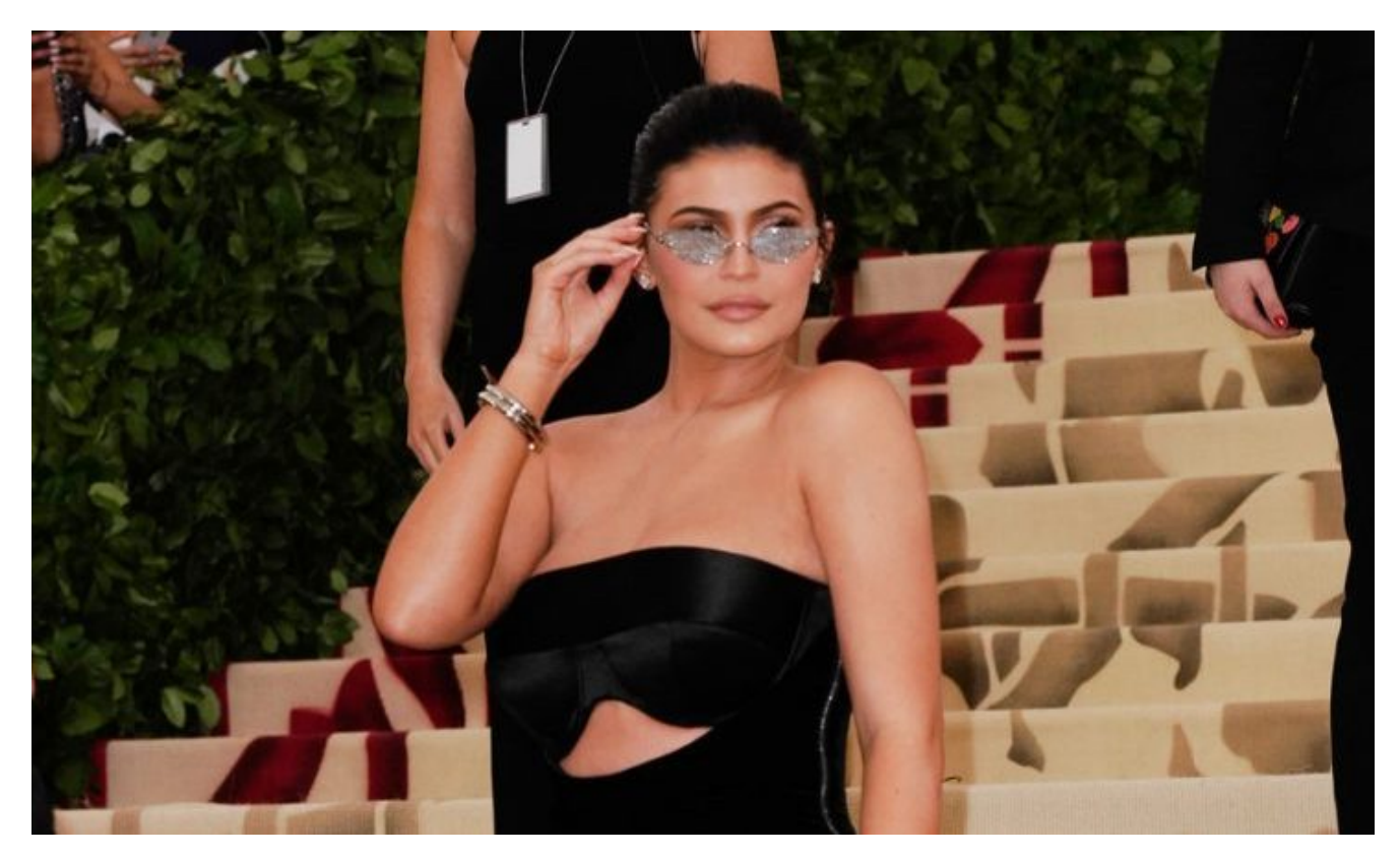
By Karley Kemble

It may seem like Valentine's Day is far enough away, but it'll be here quicker than you expect! It's never too early to start planning your <u>date night</u> outfit. After all, Valentine's Day is the perfect excuse to get dressed up, look great, AND feel amazing. There are plenty of celebrities we can look to for some outfit inspo — so if you're looking for some <u>style advice</u>, look no further! Cupid's got you covered.