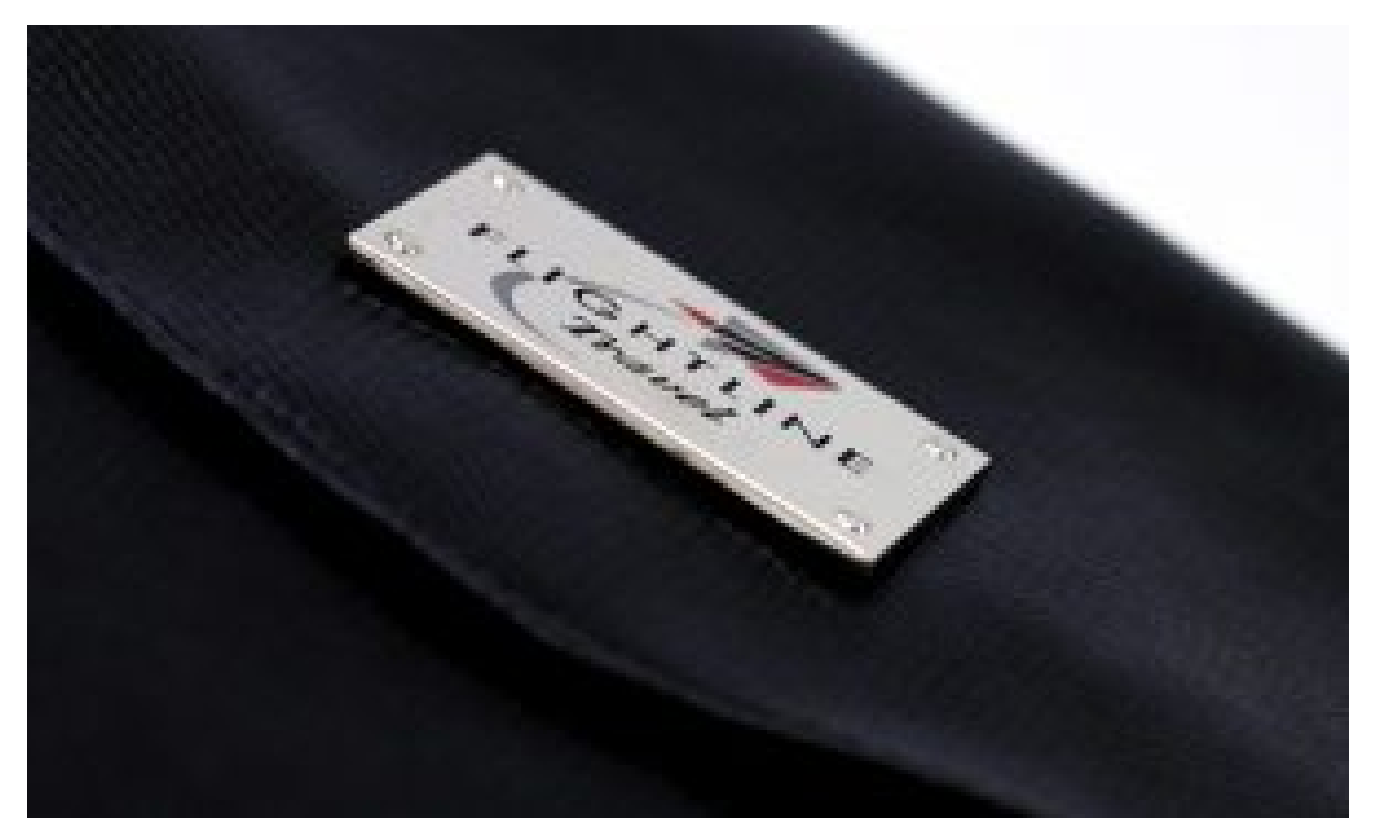
Flightline Travel Tote.

The perfect clutch for your travel essentials, the Flightline Travel Tote has thought of your every need. With side pockets especially designed to hold your passport, legal ID's, and phone, you can easily access all of your essential documents while going through security; no extra time digging through your purse needed. A patent-pending o-ring designed zipper creates the unique ability to still open the clutch while it is placed inside a seat back pocket. The tote easily detaches from other Flightline bags to make trips to the bathroom quick, and all bags come with a small strap so that you can hang your tote anywhere. Though sleek in design, the tote is big enough to hold a small tablet, expanding as wide as a thick magazine. You can customize your tote in either classic black or a deep purple, both made of vegan leather.