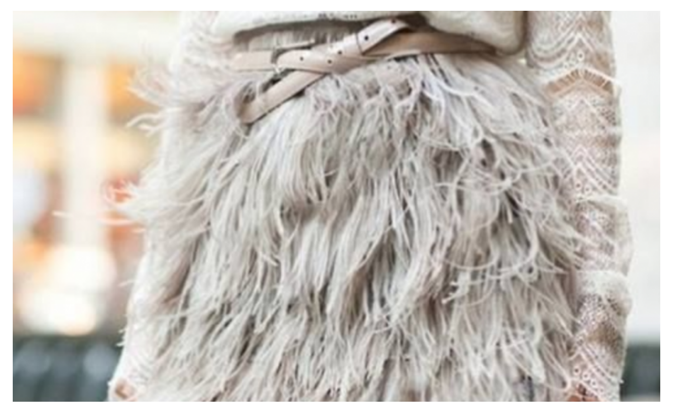
Feather Skirt

Get fun and flirty with an ostrich feather skirt, recently made popular by the new fashion trends for 2019. This is a great piece to have in your wardrobe because it can be dressed up or down. Not only is it eye-catching, but it goes great with a cashmere sweater or a blazer.