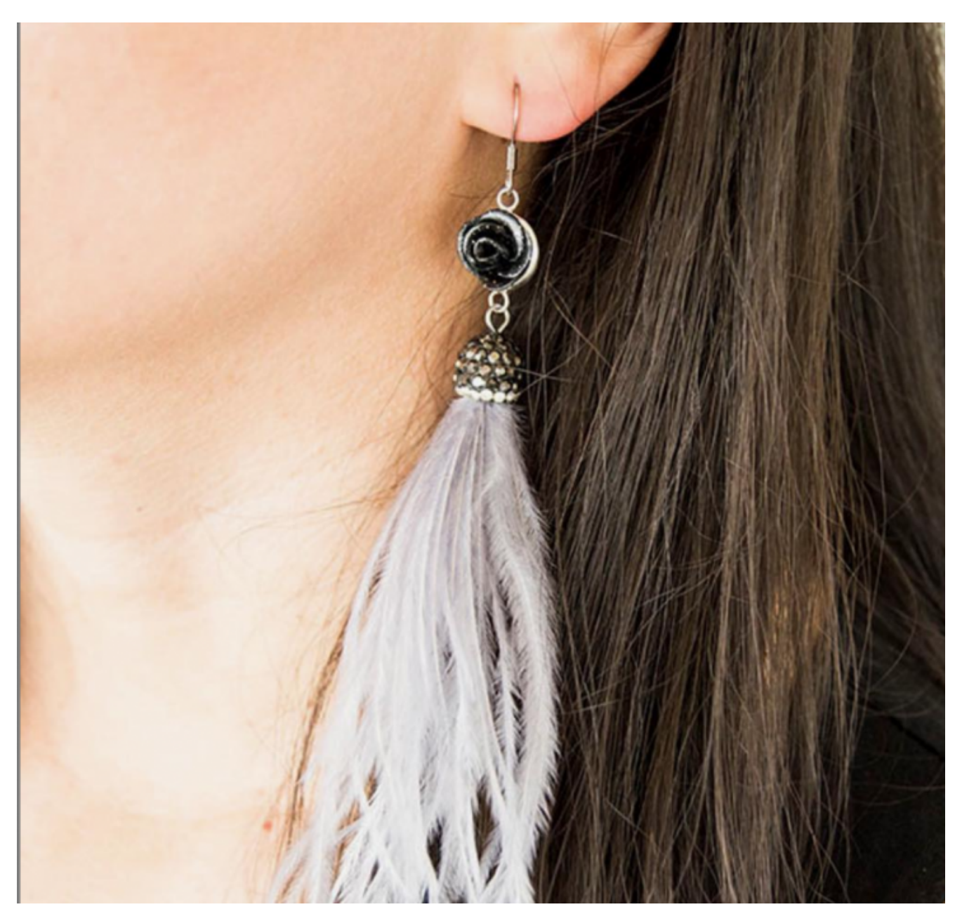
Feather Earrings

This playful accessory will dance on your neck and is sure to catch some attention with a messy updo. You can choose feather earrings with a few feathers dangling at the bottom, find a set that has multiple colors, or one single feather to float around your neck if that's more your style. Earrings are another great simple statement if you don't want to get crazy with feather coats or skirts.