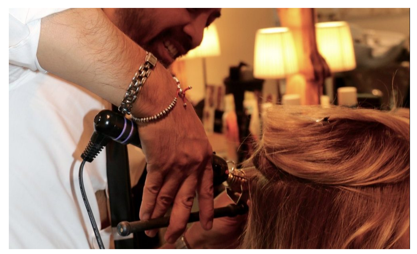
VU Hair offers styling services for any occasion

VU Hair employs extremely talented stylists that are experts in their craft. Everyone at VU Hair is an artist and based on what we just experienced, they treat your hair like a canvas and the results at the end are a work of art. These stylists want you to have a good hair day, EVERY day.