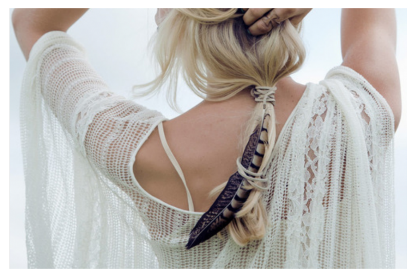
Hair feather accessory.

Probably one of the oldest feather accessories in existence, adding a feather to your hair can make you feel chic boho or whimsical without much effort. You can either tie one feather (like in the picture above) or get some clips that have feathers attached to them. Wearing them as an accessory this way might seem more natural if you don't like the other ways the trend has been gaining popularity.