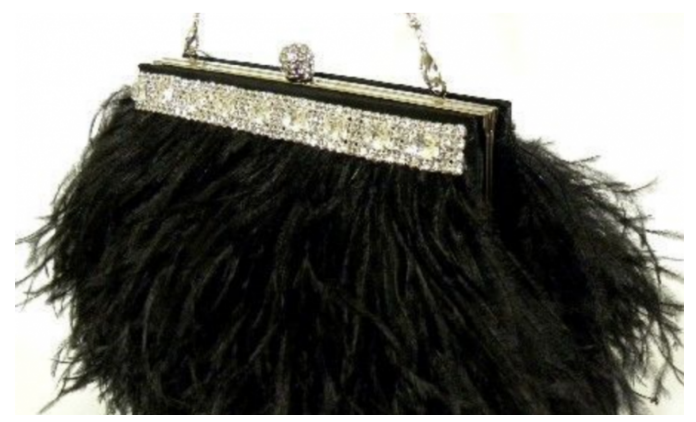
Feather Purse

We all need to be practical sometimes, right? Why not grab a clutch surrounded in ostrich feathers for your next date night? Or if you're the type of girl who has to shove everything into her bag, find a full-sized purse! It can either be covered in feathers or decorated along the trim of the opening of the bag, whatever strikes your fancy while you're shopping for your next carry-all accessory.