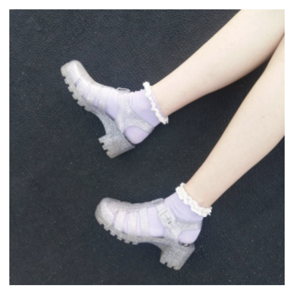
Jelly Sandals.

Related Link: Fashion Trend: 5 Ways to Wear a Bandeau Top