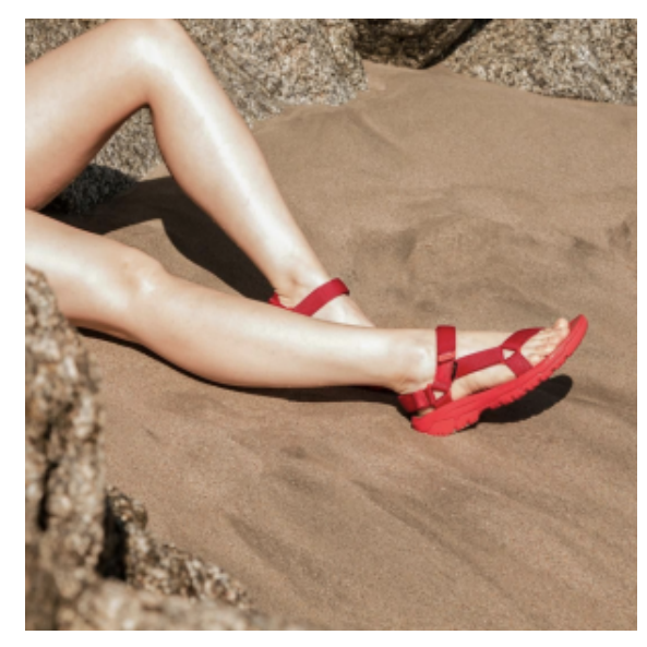
Teva Sandals.

Related Link: Celebrity Style: Funky Sunglasses