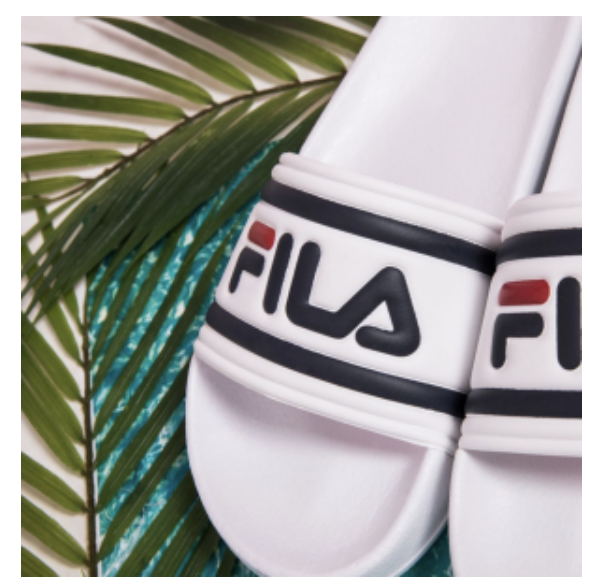
Pool Slides.

3. Pool Slides: If you're looking for a really easy ugly-cute sandal option, then pool slides are perfect for you. You can slip them on whenever you please and instantly have a look that says, "I'm ready for the beach!"