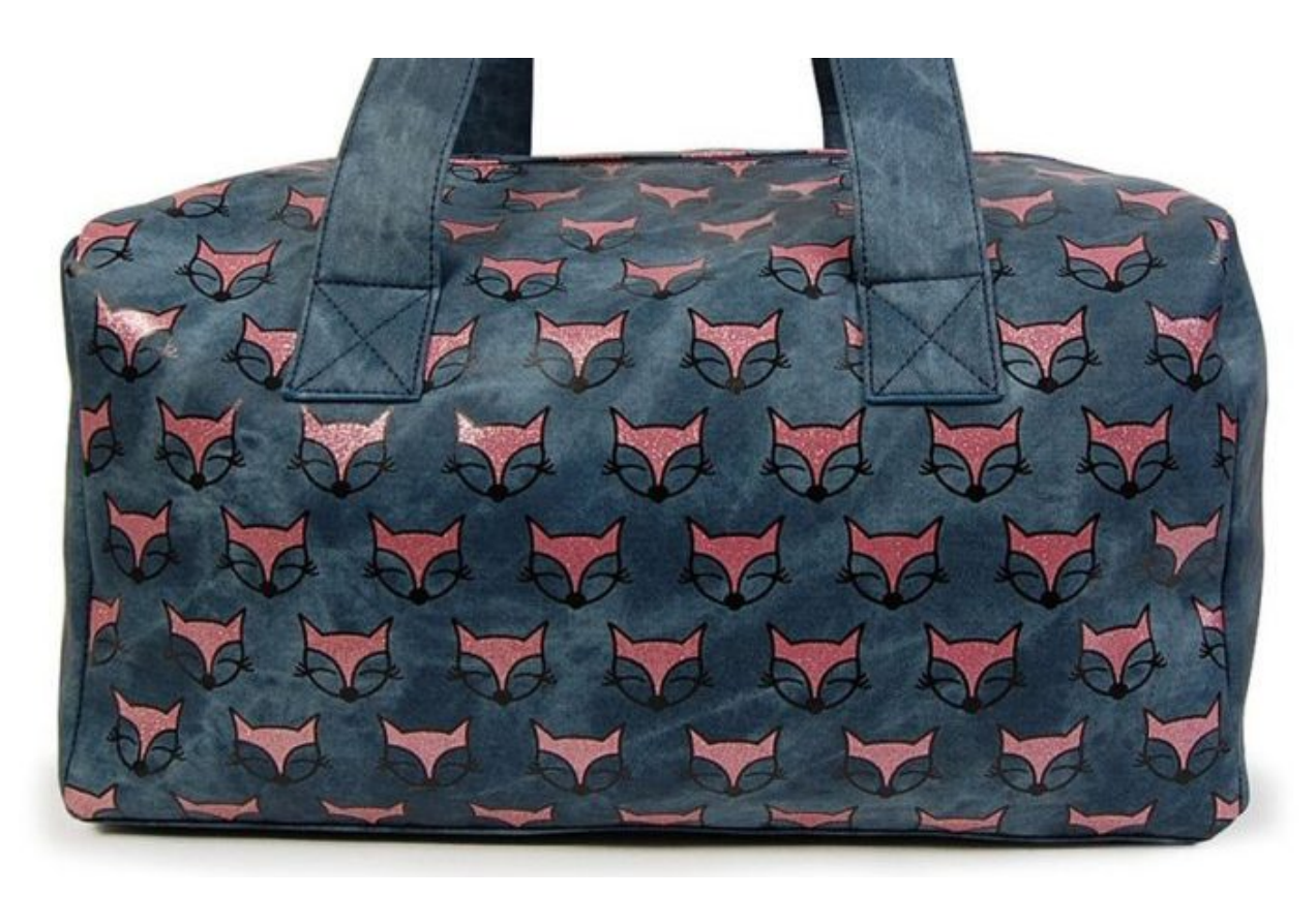
OMG Accessories Duffle.

How better to pack for a girls' weekend or a romantic getaway than in a cute patterned duffle? Available in five bubbly patterns, these bags are a flirty addition to your travel wardrobe. Names like "Denim Foxy Roxy Weekender" and "Frenchie Louie Weekender" can match your mood. All bags are made of vegan leather with a webbed nylon adjustable strap and gold hardware. Measuring 9"x18", it's the ideal size for a couple days away. The patterns are what make the bag unique, and they come with the options of "Rainbow,", "Kitty Kat," "Foxy Roxy," "Unicorn Gwen," or French bulldog "Louie."