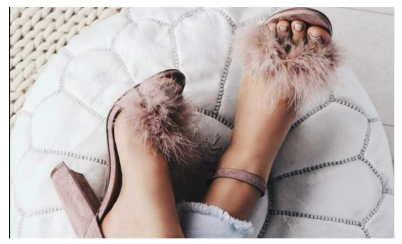
Feather Heels

From sleek heels with feathers attached from Louis Vuitton to magical KP Collections from <u>Katy Perry</u>, you might want to grab a couple pairs before feathered shoes go out of style. Wear them out for a coffee date with your bestie or in the office if you need a fun pick me up. Choose them in the sleek black and cream look like in the picture above, or find something that's bright neon pink!