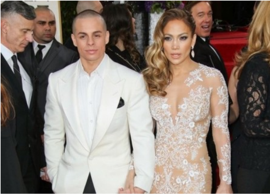
Casper Smart and Jennifer Lopez

They might not be a couple anymore, but this former pair brought beauty and elegance to the Golden Globes with their matching white outfits. Of course, Lopez shines no matter what she's wearing!