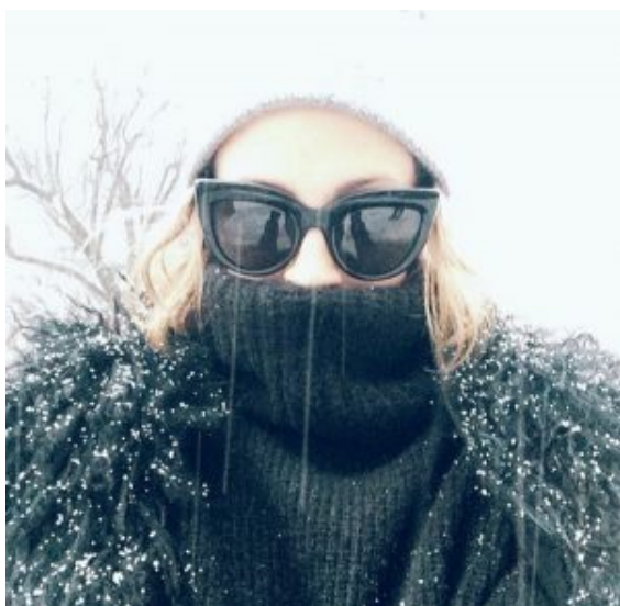
Nicole Richie.

4. Cat eye sunglasses: The 50's are making a comeback with cat eye sunglasses. People are wearing these types of shades in the style of both big and small. Nicole Richie is always donning some fabulous sunglasses so of course she was wearing some of these.