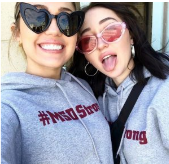
Miley Cyrus and her sister Noah Cyrus.

2. Fun shapes: If you are walking around with sunglasses in the shape of a heart, triangle, or octagon, you are sure to receive some dotting stares. We saw Miley Cyrus wearing some cool heart shaped shades along side her sister on Instagram.