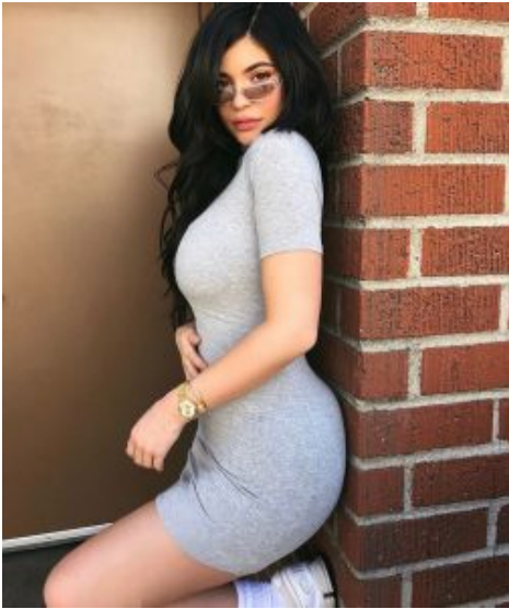
Kylie Jenner.

2. Fun shapes: If you are walking around with sunglasses in the shape of a heart, triangle, or octagon, you are sure to receive some dotting stares. We saw Miley Cyrus wearing some cool heart shaped shades along side her sister on Instagram.