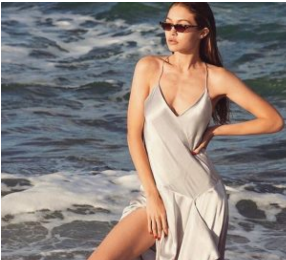
Gigi Hadid.

1. Tiny shades: Many fabulous celebrities have been sporting sunglasses that are long and rectangular. They are definitely smaller than the typical sunglass size, and that is what makes them so funky. Celebs like Gigi Hadid and Kylie Jenner seem to really like this trend.