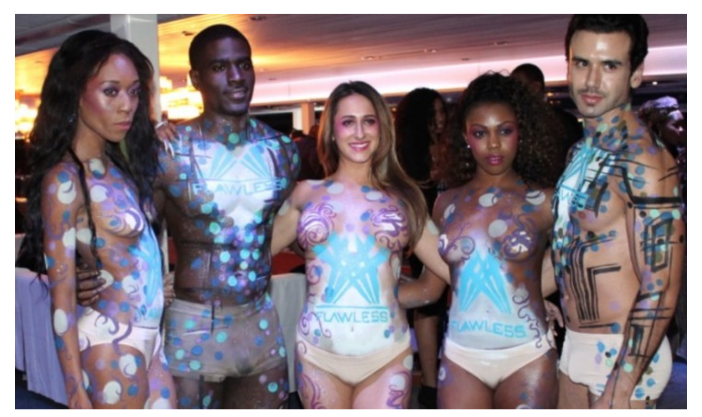
Event performers.

space was a very unique opportunity. I managed to get all of these high fashion models and help them utilize their additional skill sets."