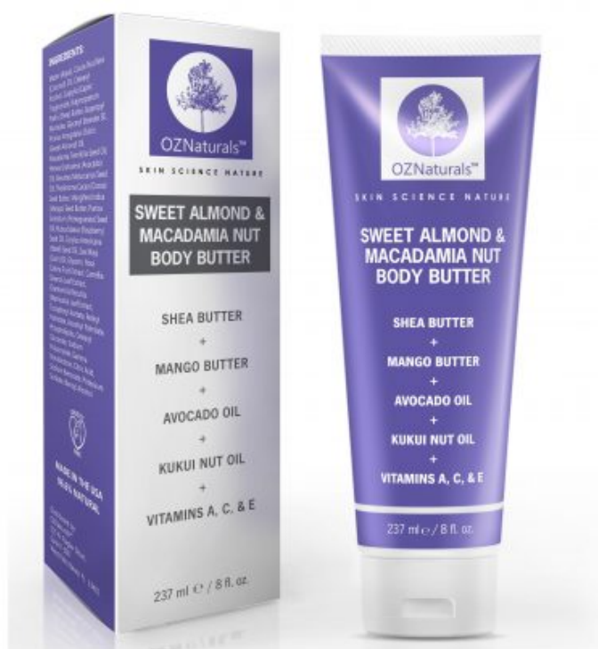
OZNaturals Sweet Almond and Macadamia Nut Body Butter

A date night in most handbooks involves touching and exploring, but no one wants dry skin while enjoying the “chill” in “Netflix and chill.” OZNatural Body Butter is a rich body moisturizer that provides a healthy hydrated skin and that refines the look and feel of it. Macadamia nut oil nourishes dry skin with vitamins A, B1- B2 and B6 and Omega 7 acids all found in Sweet Almond oil. OZNaturals’ goal is to give you beautiful skin.