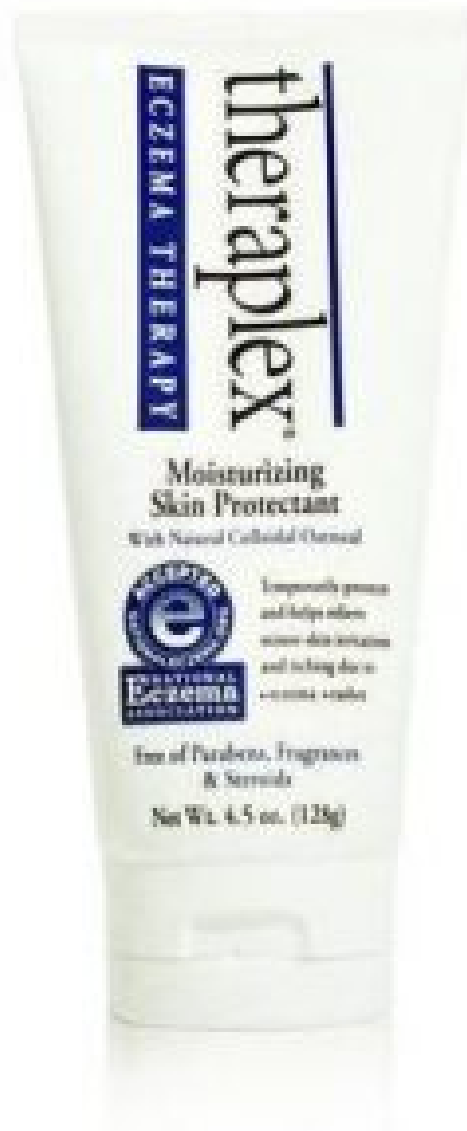
Theraplex Eczema Therapy

Theraplex® Eczema Therapy Moisturizer is a non-greasy moisturizing skin protectant with natural colloidal oatmeal to temporarily protect and help relieve minor skin irritants and itching due to eczema and rashes. This enriched formula helps to relieve and soothe dry skin, offering hours of protection and moisture leaving skin feeling soft and smooth. $18.00