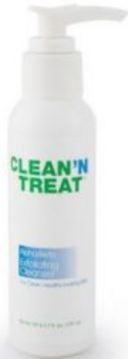
Theraplex Clean 'N Treat Alpha/Beta Cleanser

Theraplex® Clean 'N Treat Cleanser is a soapless creme cleanser which removes oil, dirt and makeup without stripping or drying the delicate skin on the face for clean, healthy-looking skin. It is specially formulated with a combination of glycolic, lactic and salicylic acids to gently exfoliate and slough away dead skin cells leaving pores clean and free of oil and cellular debris. Gentle enough for sensitive skin, Theraplex Clean 'N Treat Cleanser leaves skin feeling fresh, clean and hydrated. $15.00