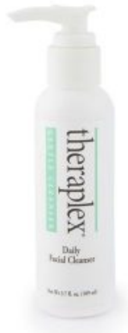
Theraplex Gentle Cleanser

Theraplex also offers two facial cleansers, both gentle enough for daily use.