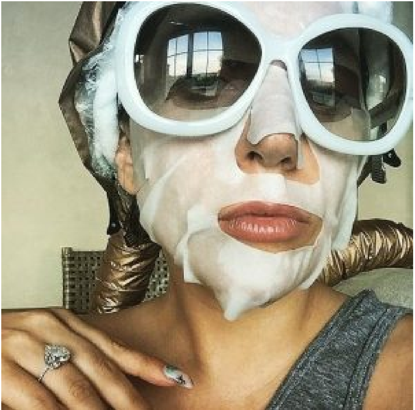
Lady Gaga's Instagram