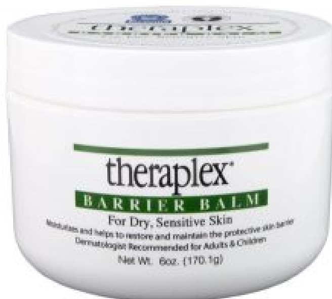
Theraplex Barrier Balm

Theraplex® isn't just for those with overly dry skin. It is for anyone looking for a gentle formula to apply to their skin when trying to keep it hydrated and moisturized, which is so important during summer. These products are guaranteed to leave you glowing on your next date night !