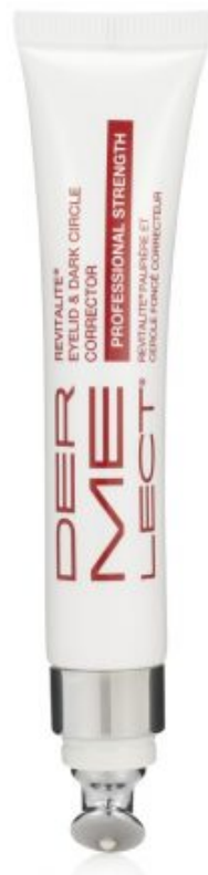
Revitalite Eyelid and Dark Circle Corrector

The daily grind can be very tiring and may bring puffy and dark circles underneath your eyes from lack of sleep. But, when it comes to date night, panda eyes is the last thing you want. Dermelect attacks these issues by reducing dark circles under the eye and focuses on soothing and concealing elements. Dermelect is made to give you a youthful well-rested look for every date night. The cream works instantly with soothing ingredients that work to reduce the dry skin around your eyes, while it evens and tightens your skin. The eye cream features hydration and tightening agents to address droopy, puffy and dark eyelids.