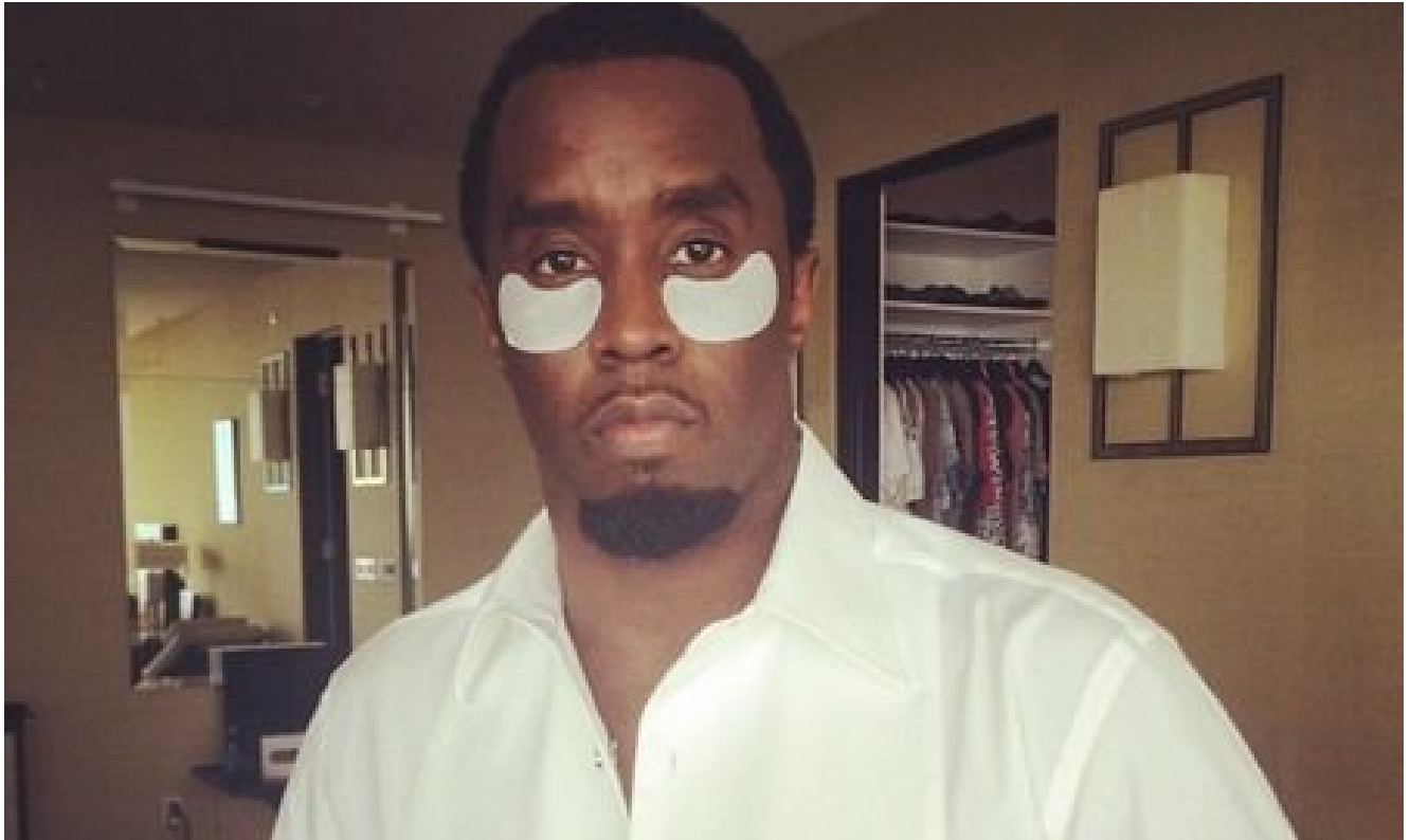
P Diddy sporting collagen eye gels