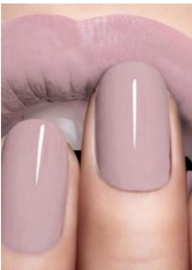
Mauve nails.

2. Novel Nails: At your next manicure, consider this shade of mauve as your preferred pigment, a trendy, grown-up alternative to a bold color like purple or pink. Find a lip tint that matches for a coordinated, stand-out look, or let your nails sparkle as a lovely touch to an otherwise ordinary outfit. This neutral tone on your nails will add just enough eye-catching color to make any look go from forgettable to fantastic.