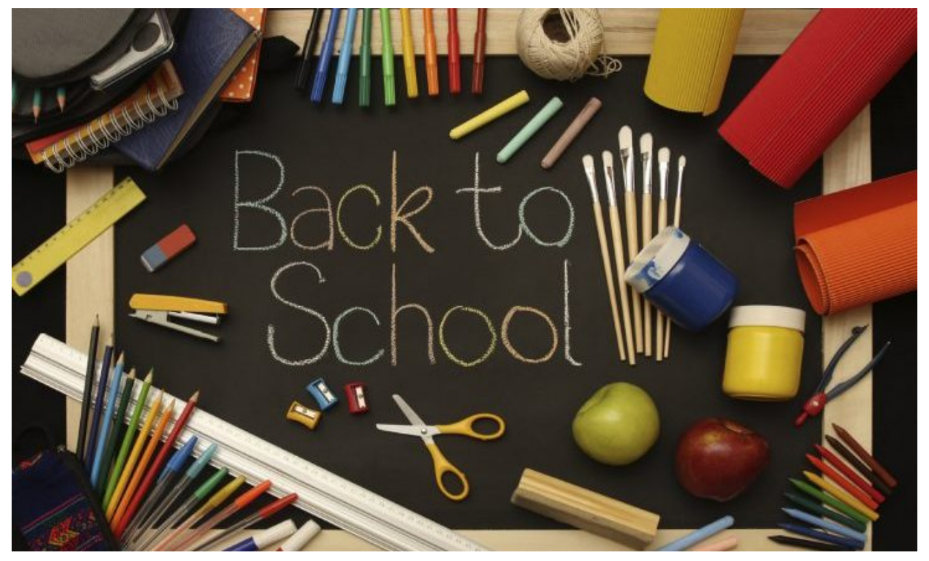
By Bre Gajewski

No matter how old your child is, back to school can be timeconsuming, expensive and all-around stressful.