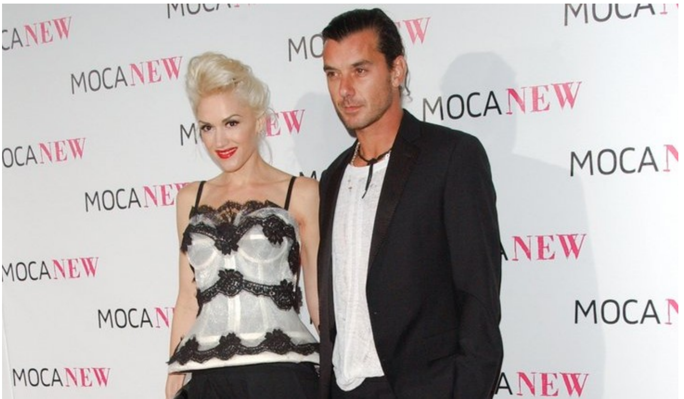
Gwen Stefani and Gavin Rossdale

This musical duo surprised everyone when they announced their