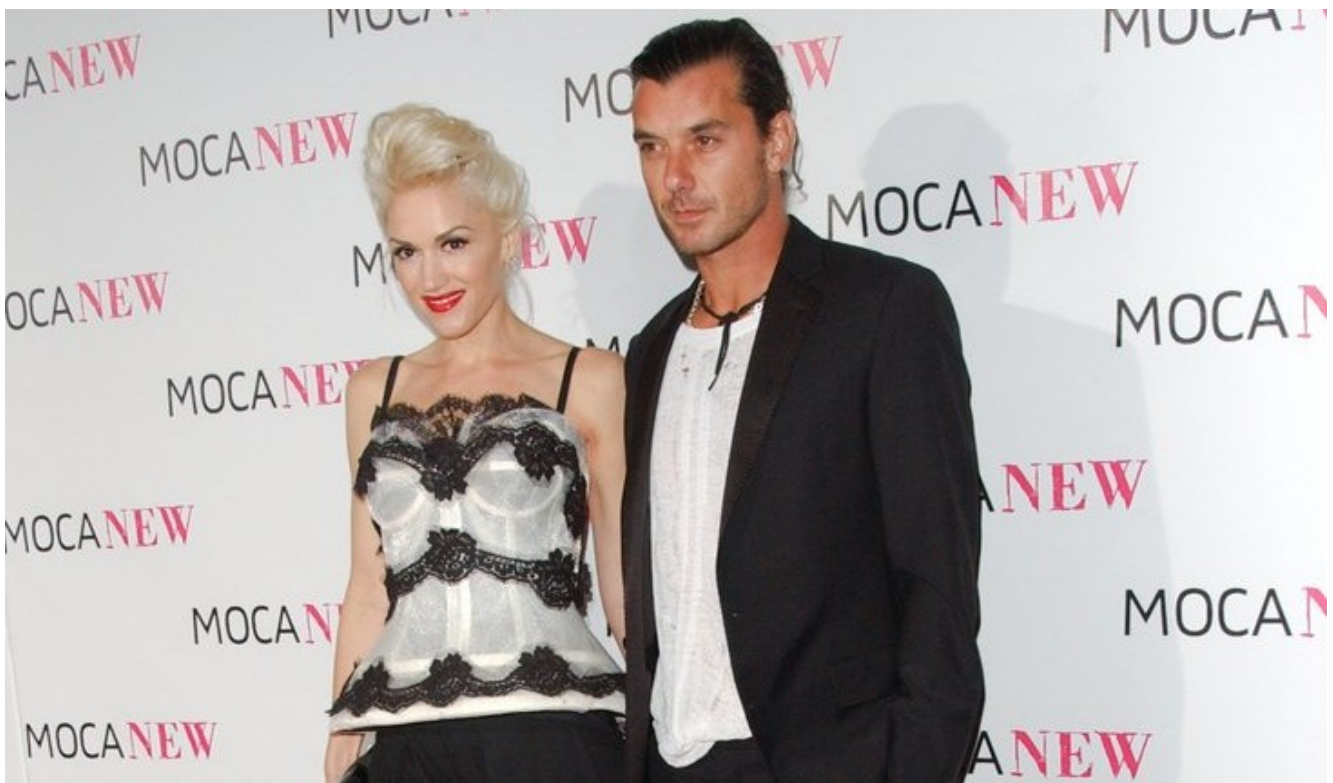
Gwen Stefani and Gavin Rossdale

This musical duo surprised everyone when they announced their