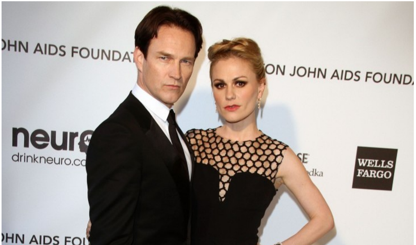
Stephen Moyer and Anna Paquin

These sexy stars of 'True Blood' wed in 2010, paying no attention to their 12-year age gap. Moyer is 45 years old, and Paquin is 33 years old.