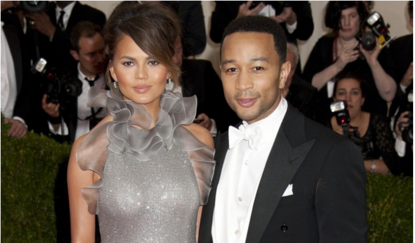
Chrissy Teigen and John Legend

The soulful singer-songwriter and his wife, who has been in the media for her humorous crying face, most recently appeared at the Grammys on Feb. 8. Legend and Common will be performing the Oscar-nominated song 'Glory' from the movie 'Selma.' Fingers crossed that they take home the golden statue!