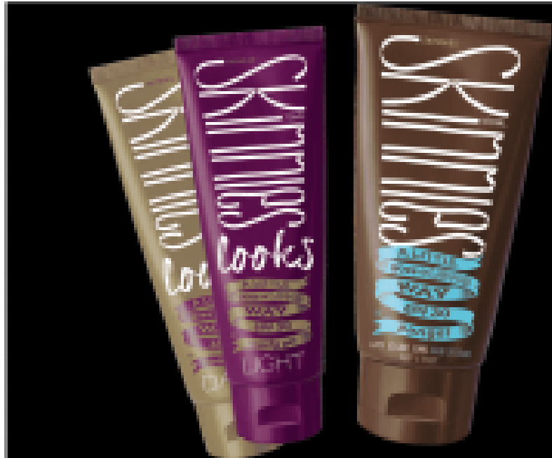
Skinnies Sungel SPF 30

If you are escaping to warmer weather, or even if you are just going to be spending a lot of time outside, you definitely need sunscreen. If you are from a colder climate and haven't been outside much the past few months, your skin is not at all prepared for UV Rays. You need a strong and reliable SPF to protect you.