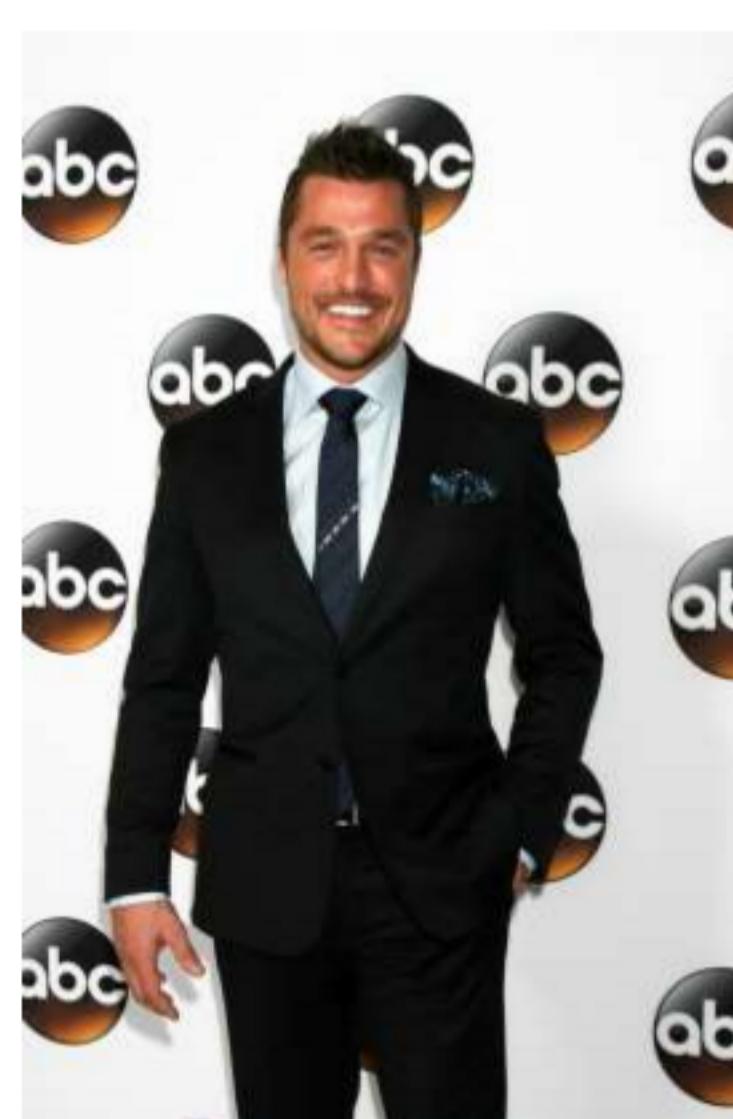
Chris Soules: 'My dating life is relatively non-existent'

Chris Soules won't be putting his bachelor days behind him anytime soon. The handsome pig farmer and star of the 19th season of 'The Bachelor' says his dating life is "relatively non-existent" at the moment.