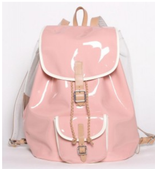
The Takashi bag by Harper Avenue.

In our exclusive author interview, the dating expert gives us a glimpse behind the evolution of clutch and reveals her best relationship advice about online dating and having the courage to find true love. And the best part? If you're still searching for the perfect gift this holiday season, the Takashi bag by Harper Avenue is a must-have holiday item. Use the discount code below for 20 percent off!