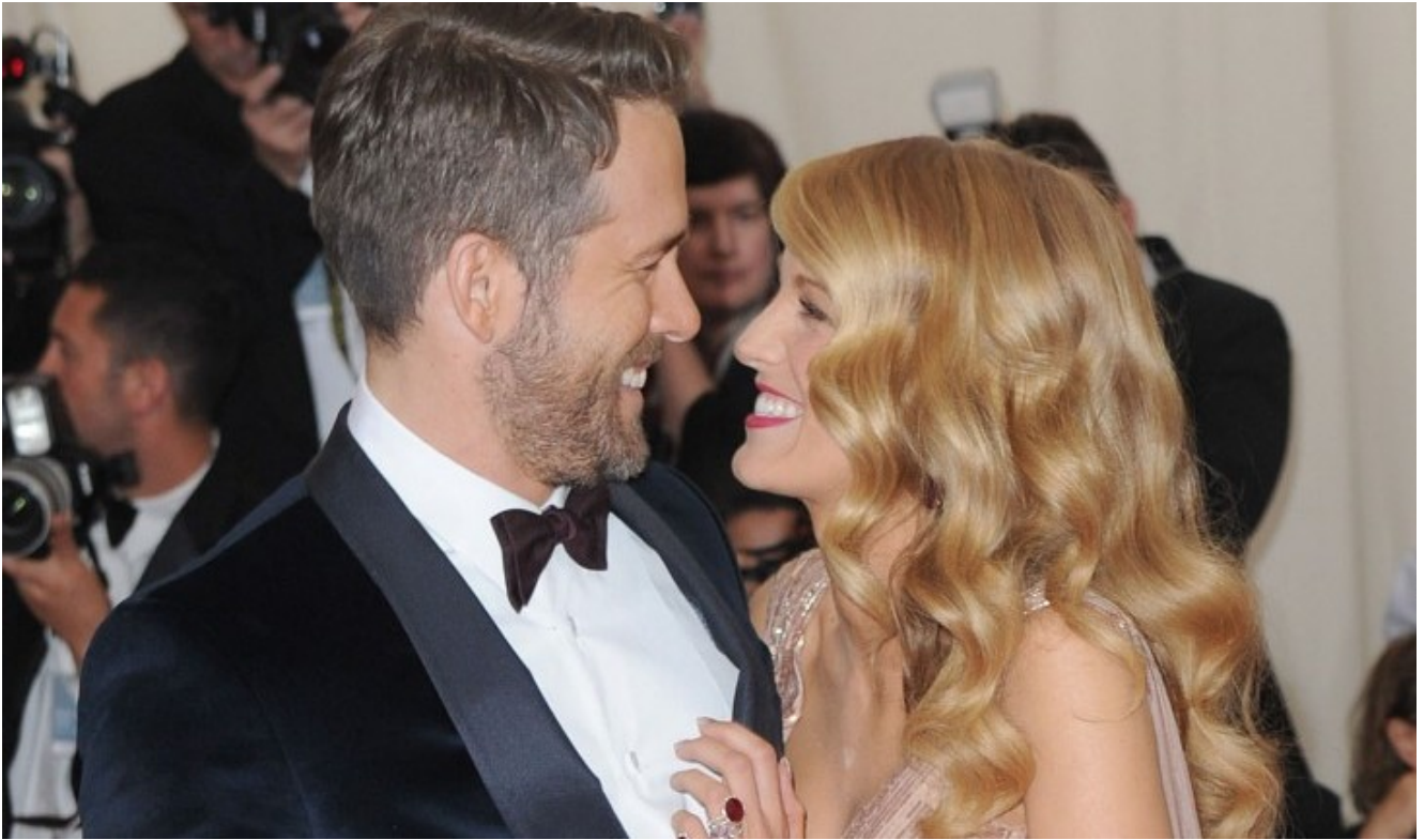
Ryan Reynolds and Blake Lively

This adorable couple met while filming 'Green Lantern,' in which Reynolds played the superhero and Lively was his love interest. They were married on September 2012 and most recently walked the red carpet together at the Cannes Film Festival.