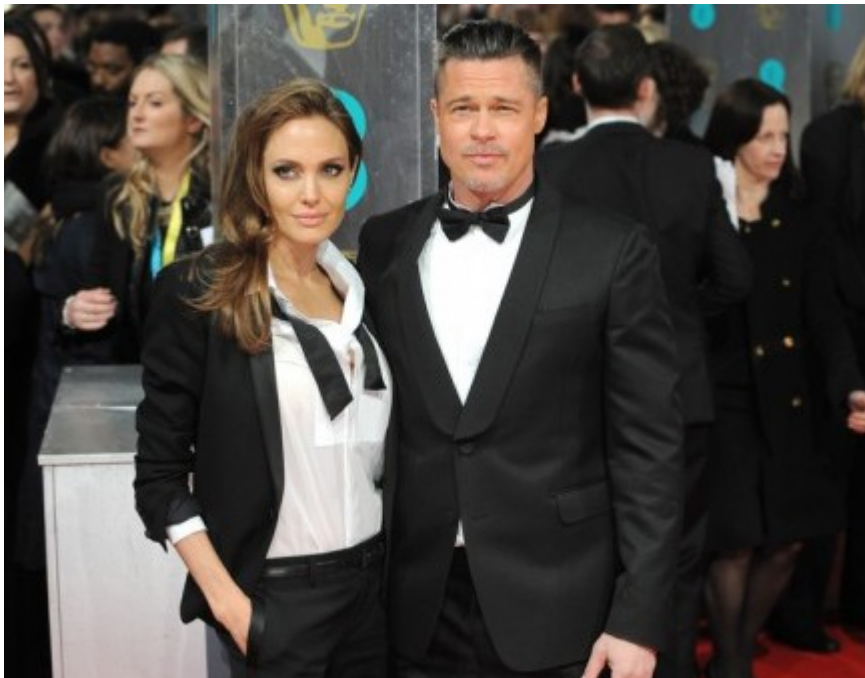
Brad Pitt and Angelina Jolie

This power couple has welcomed six adorable children into their family -- three of whom they adopted -- since they began dating in 2005. In April 2012, they announced their