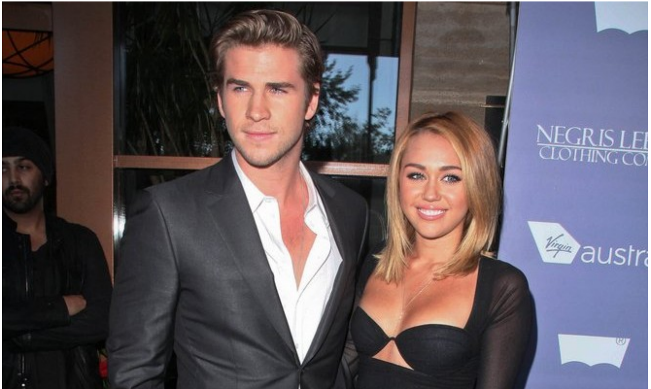
Liam Hemsworth and Miley Cyrus

This young couple met on the 2010 set of their movie 'The Last Song' and announced their engagement in August 2012. Unfortunately, the pair called things off about a year later. While the pop star has said, "It was so fun wearing a fat rock for a few years," she's remained single since the split.