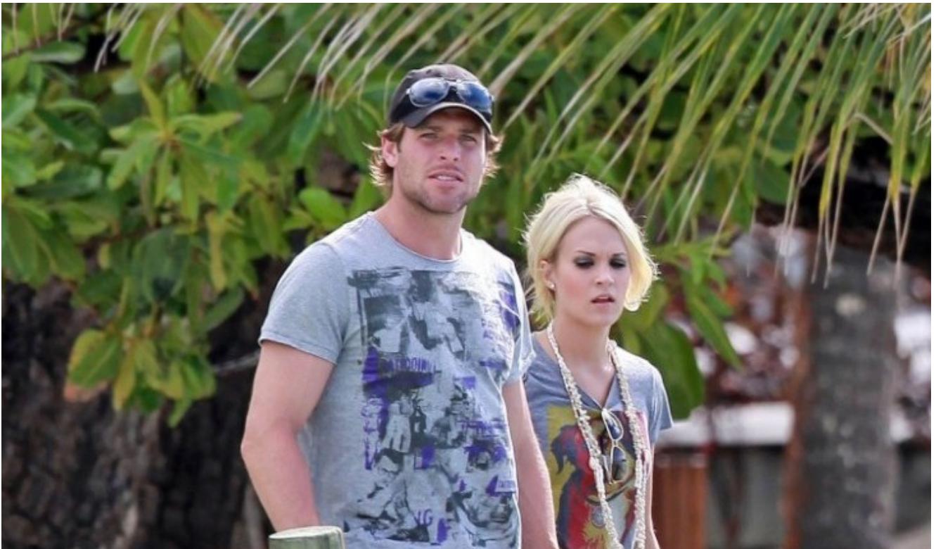
Mike Fisher and Carrie Underwood

The Nashville Predators hockey player and country singer got