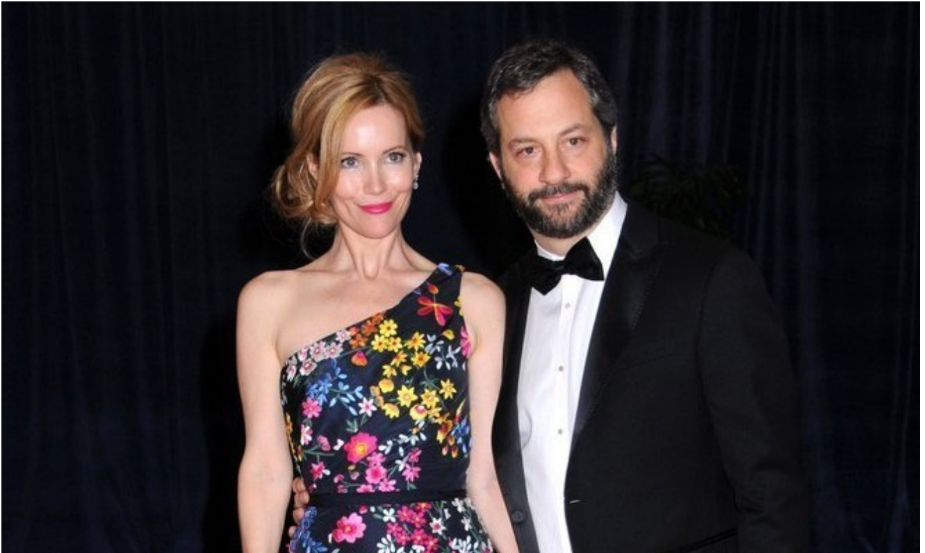
Leslie Mann and Judd Apatow

The hilarious actress and her film producer husband met on the set of 'The Cable Guy' in 1996 and were married a year later. Since then, this celebrity couple has worked together on a number of comedies, including 'The 40 Year Old Virgin' and 'Funny People.'