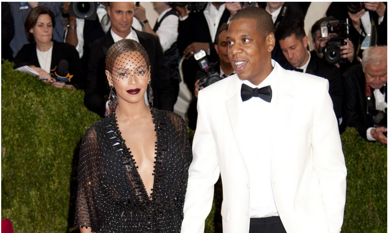
Beyonce and Jay Z

Known as the queen and king of music, this couple is one of