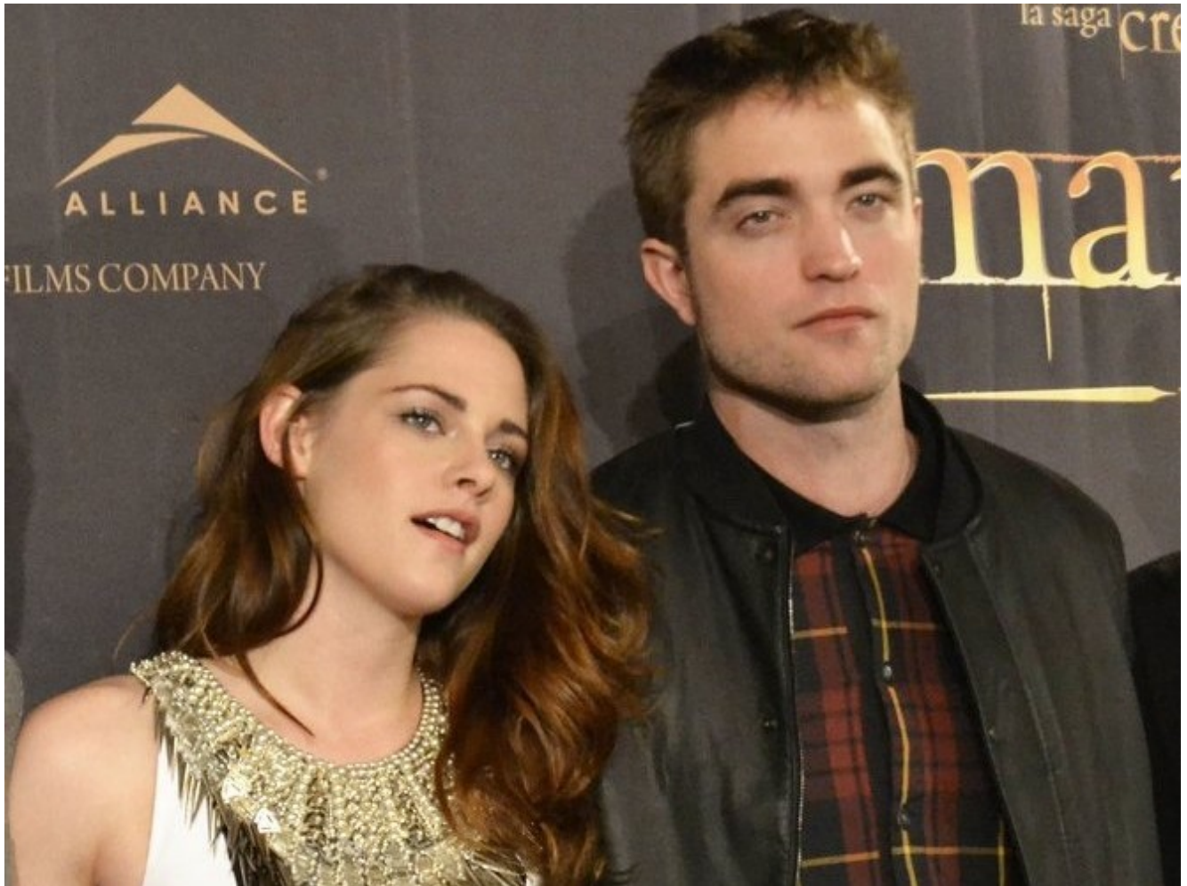
Kristen Stewart and Rob Pattinson

This 'Twilight' couple, now split, was the center of media attention when the actress was caught cheating on longtime boyfriend Pattinson with director Rupert Sanders, who was married at the time and has two children.