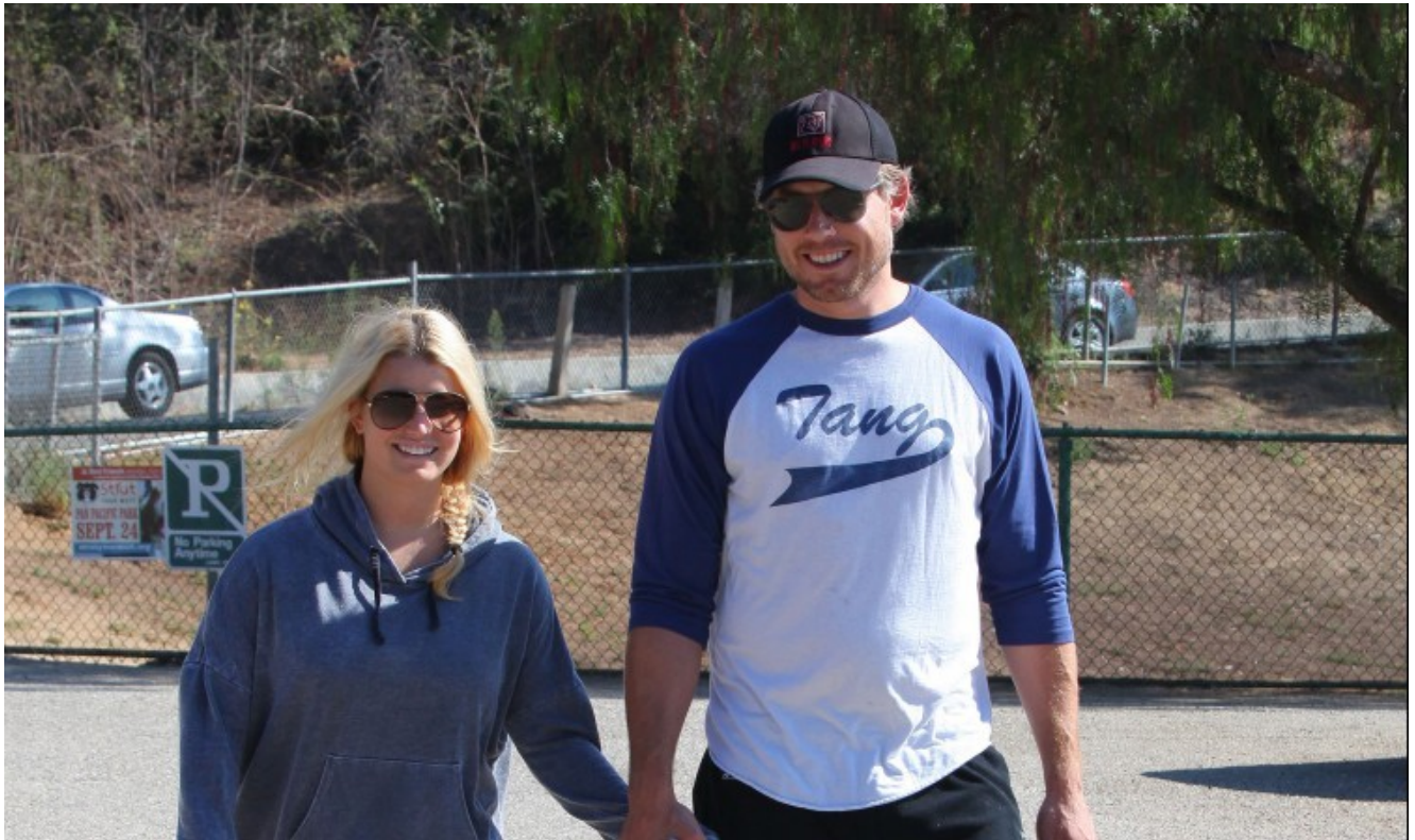
Jessica Simpson and Eric Johnson

Love Lesson 1: Don't be afraid to be yourself.