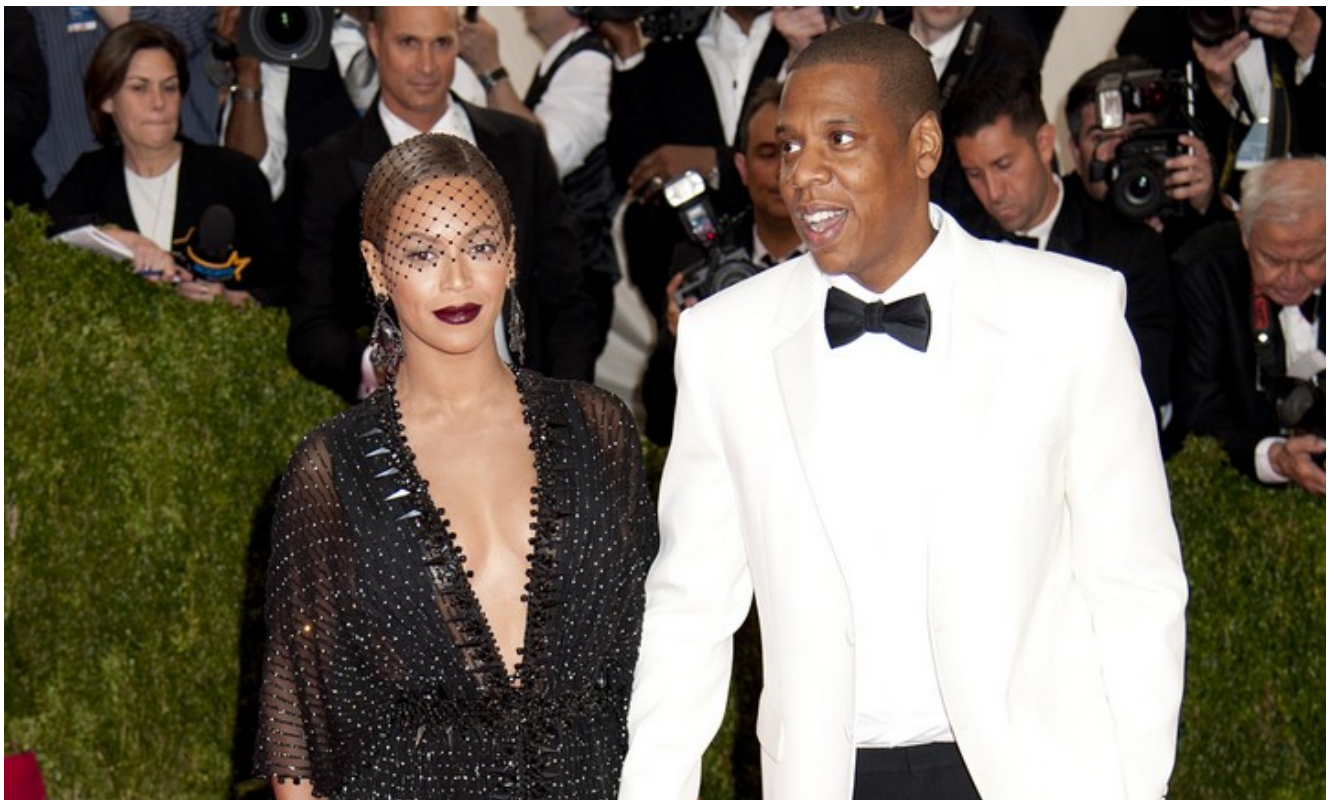
Beyonce and Jay Z

Known as the queen and king of music, this couple is one of