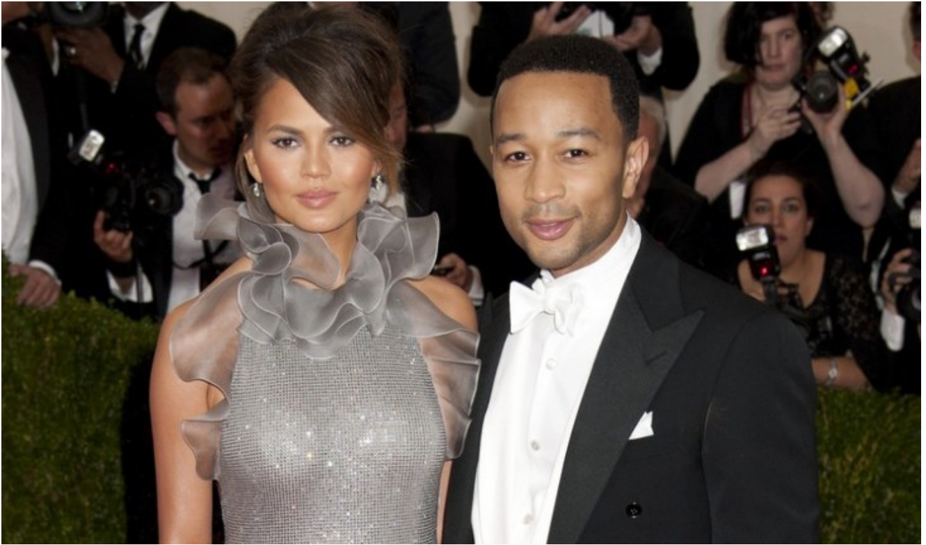
Chrissy Teigen and John Legend

The soulful singer-songwriter and his wife, who has been in the media for her humorous crying face, most recently appeared at the Grammys on Feb. 8. Legend and Common will be performing the Oscar-nominated song 'Glory' from the movie 'Selma.' Fingers crossed that they take home the golden statue!