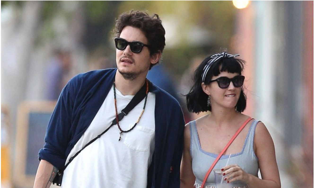
John Mayer and Katy Perry

The singer-songwriter dated Taylor Swift from September 2009 to January 2010. After their celebrity break-up, she penned the song 'Dear John,' which reportedly "humiliated" Mayer. He then began an on-again, off-again relationship and love with the 'Firework' singer. In recent months, there have been rumors of a feud between the two pop stars. Perhaps they're fighting over the soulful crooner?