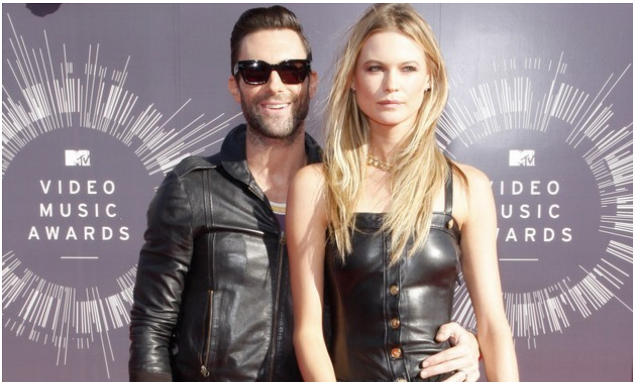
Adam Levine and Behati Prinsloo

This beautiful couple got hitched in July and walked their first red carpet as husband and wife at the MTV Video Music