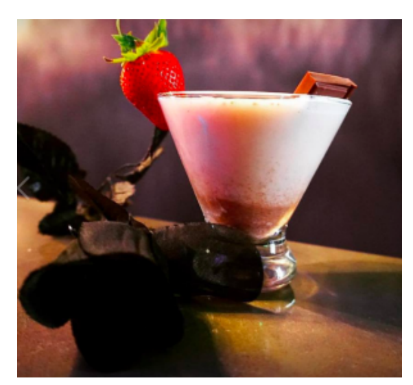
The Chocolate Factory Martini.

The Chocolate Factory Martini: Try a sip of rich and creamy drink that will make you feel like a kid again! This remake of a kid-like treat is mixed with Dorda chocolate liqueur, creme de cocoa, cream, and Vanilla vodka. It's not purely your imagination, this drink is delicious as it looks!