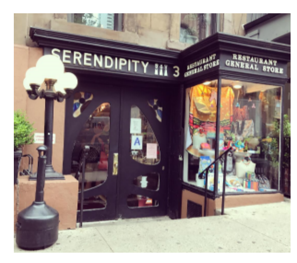
225 E 60th St, New York City, NY 10022, USA

hot chocolate like John Cusack and <u>Kate Beckinsale</u> did in the film! The restaurant's menu has a wide variety of desserts you can choose from. If you plan on having a winter getaway in New York, make sure to visit this movie magic place.