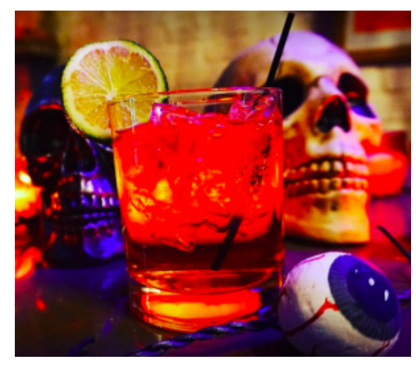
This is Halloween drink.

Related Link: How to Meet A Man on Halloween