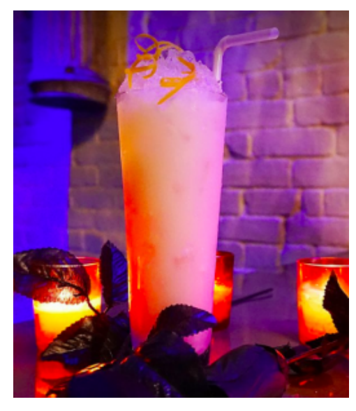
The Jack Skellington drink.

Related Link: Famous Restaurants: NYC's Most Popular Hidden Restaurants