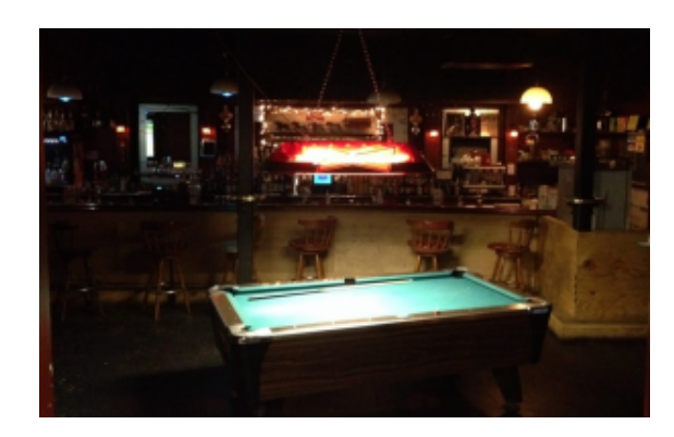
140 Dexter St Pawtucket, RI 02860, USA

5. Larry's Lounge from 27 Dresses: Sing your heart out to "Bennie and The Jets" at this dive bar. If you plan on visiting Pawtucket, RI, this is a must stop! The bar has comedians and a friendly staff. It might even be a fun place to have a bachelorette party.