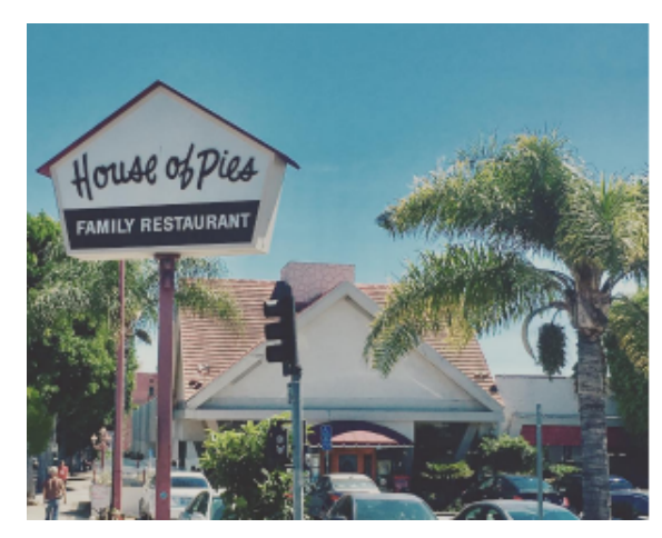
1869 N Vermont Ave, Los Angeles, CA 90027, USA

3. House of Pies from No Strings Attached: Order a sweet treat and coffee at this little slice of heaven! This restaurant was the location where Ashton Kutcher and Natalie Portman shot their breakfast scene together. The food is so delicious, you might make people thinking you eat like a baby dinosaur!