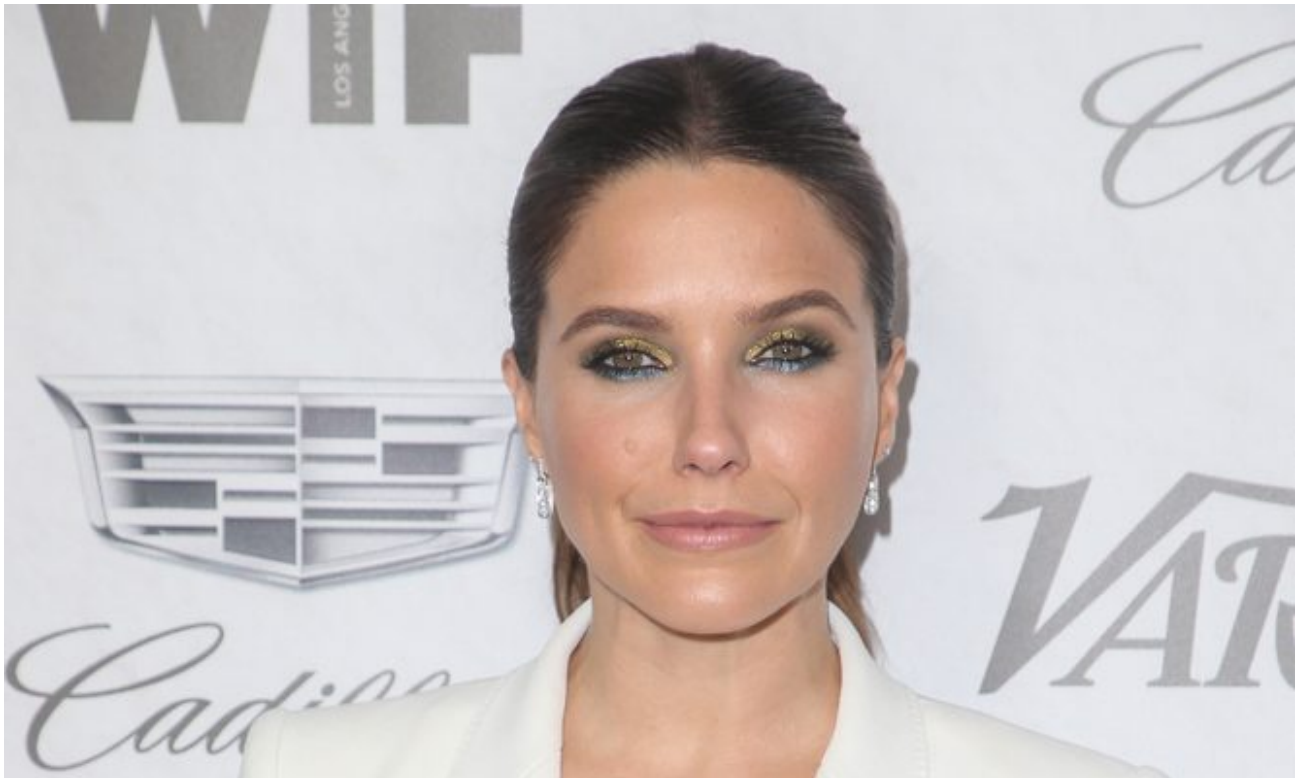
Sophia Bush at Variety and Women in Film.