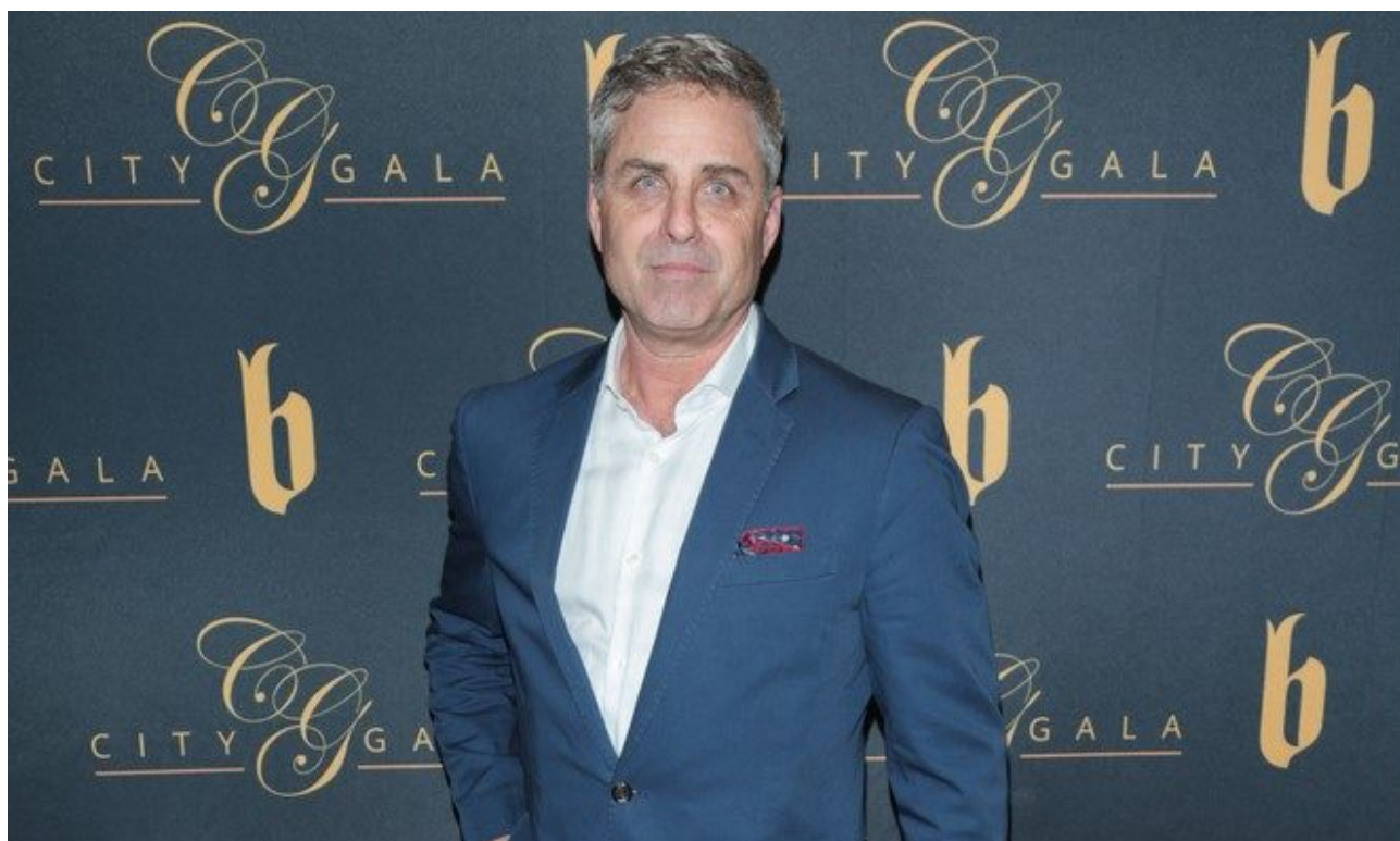
Mark L. Walberg.