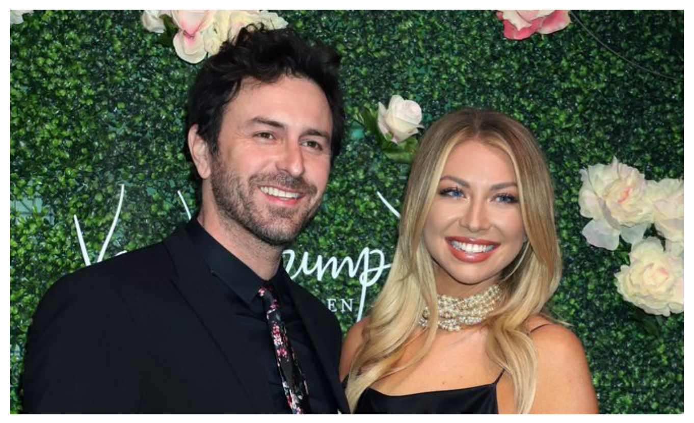
By <u>Meghan Khameraj</u>