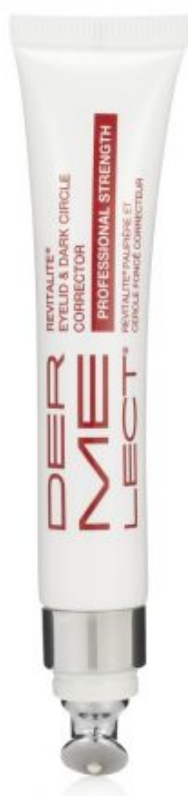
Revitalite Eyelid and Dark Circle Corrector

The daily grind can be very tiring and may bring puffy and dark circles underneath your eyes from lack of sleep. But, when it comes to date night, panda eyes is the last thing you want. Dermelect attacks these issues by reducing dark circles under the eye and focuses on soothing and concealing elements. Dermelect is made to give you a youthful well-rested look for every date night. The cream works instantly with soothing ingredients that work to reduce the dry skin around your eyes, while it evens and tightens your skin. The eye cream features hydration and tightening agents to address droopy, puffy and dark eyelids.