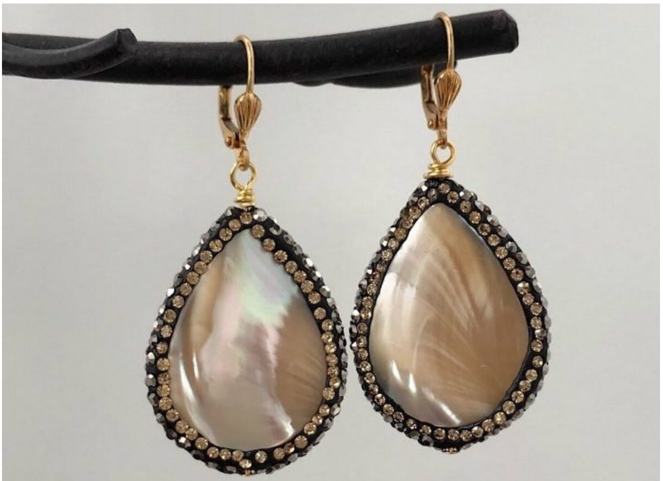
Isabelle Grace Jewelry “Madreperla Drop earrings”

Isabella Grace Jewelry features one-of-a-kind pieces designed to be a keepsake. The Madreperla Drop earrings are a chocolate brown pearl highlighted with a two-toned crystal and draped on your choice of gold- or silver-plated lever-back ear wires. These earrings are the perfect bling to pull off the rest of your look on date night.