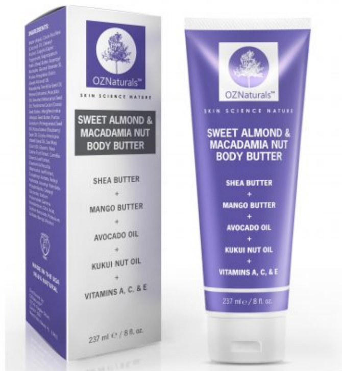
OZNaturals Sweet Almond and Macadamia Nut Body Butter

A date night in most handbooks involves touching and exploring, but no one wants dry skin while enjoying the “chill” in “Netflix and chill.” OZNatural Body Butter is a rich body moisturizer that provides a healthy hydrated skin and that refines the look and feel of it. Macadamia nut oil nourishes dry skin with vitamins A, B1- B2 and B6 and Omega 7 acids all found in Sweet Almond oil. OZNaturals’ goal is to give you beautiful skin.