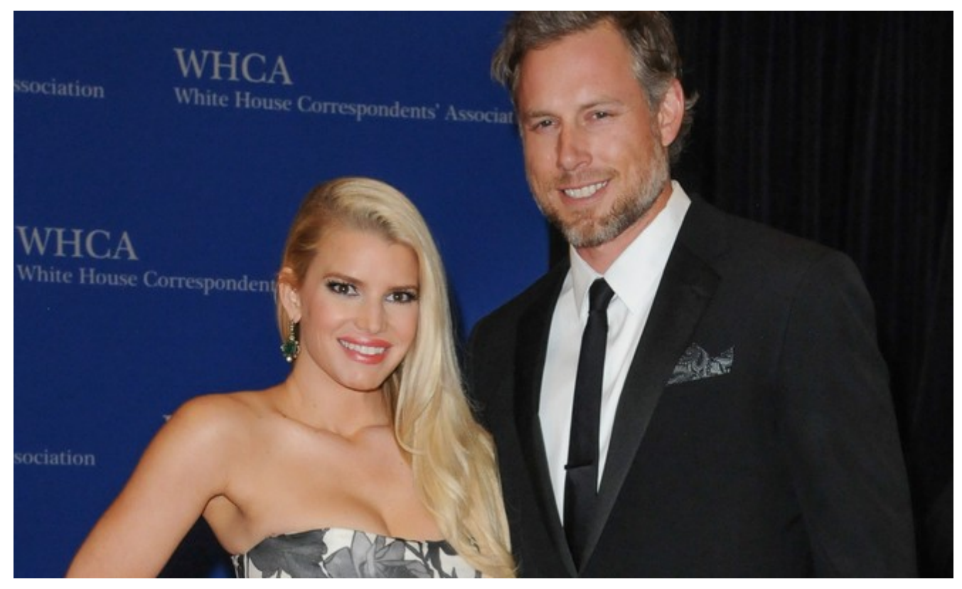
Page 1 of 10