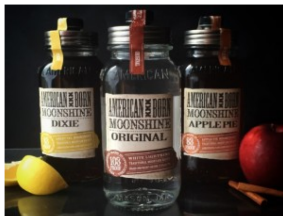
American Born Moonshine: Dixie, Original, and Apple Pie flavors.

Signature Sole Socks are designed to fit everyone with sizes running from small to large for both males and females. These versatile socks come in a range of colors, including pink, orange, and even leopard and zebra print. Depending on the style, the socks will cost you between $25 and $35. You'll be giving more than just one gift when you purchase a pair of Signature Sole Socks: A portion of each sale goes towards a sock donation to children in the hospital. This low-priced gift is sure to make everyone's holiday season a lot more cozy!