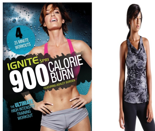
900 Calorie Burn DVD and the Petal Back Racer Tank from Gaiam.

Our favorite drink for the holiday season is the Ginger Snap, which is two ounces of American Born Moonshine in Apple Pie mixed with four ounces of ginger ale. It's the perfect treat to warm you up after a chilly day spent playing in the snow with your loved ones! That special guy in your life will love adding this unique liquor to his bar selection.