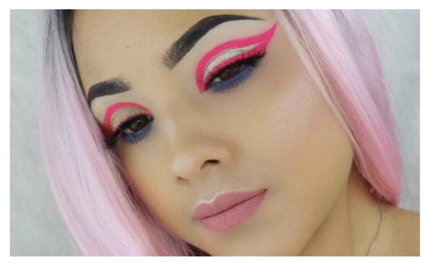
Neon Pink Eyeliner.

Have any more neon eyeliner inspirations that you'd like to share? Comment below.