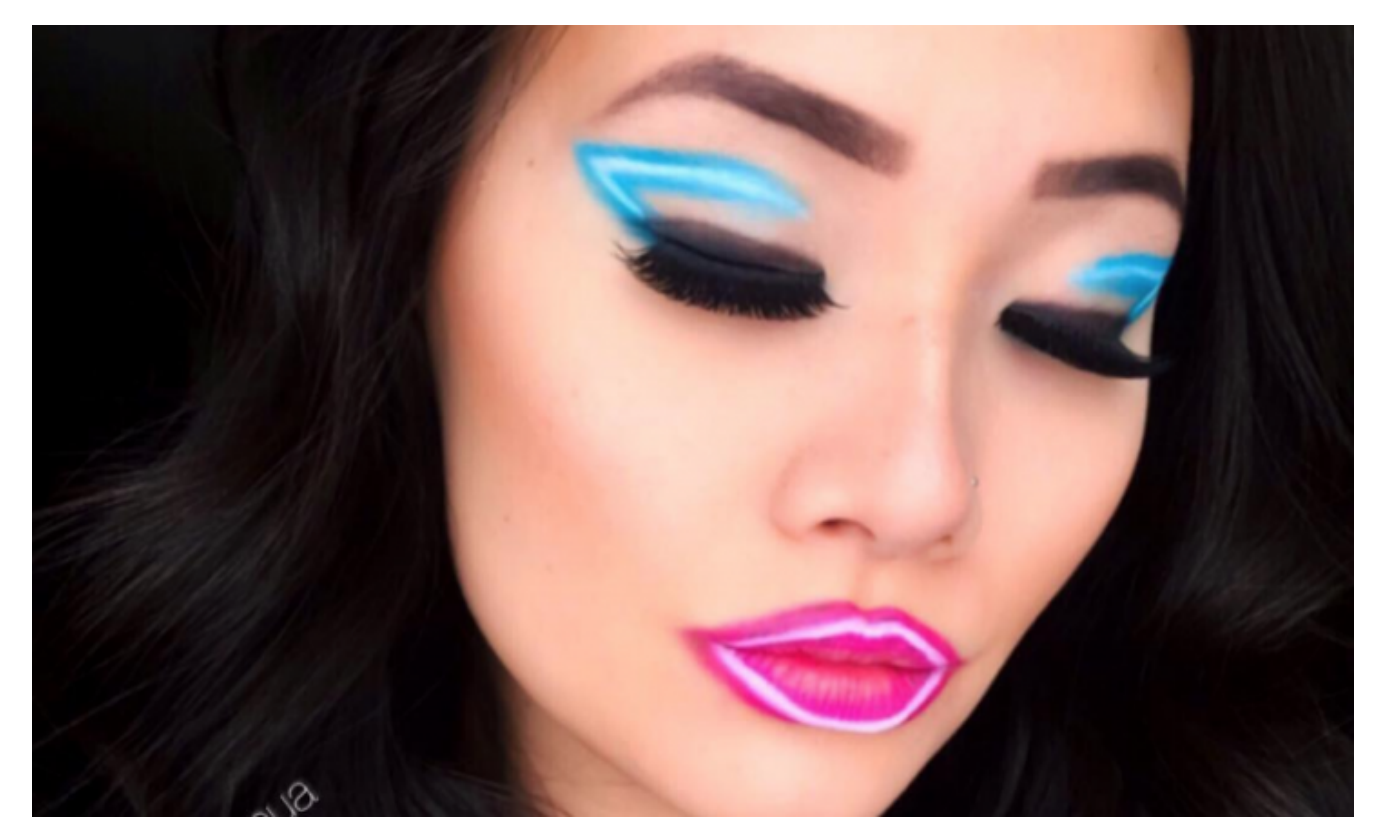
Neon Blue Eyeliner.

Neon Green Eyeliner: For this look, start off by using green eyeshadow to create a background effect for your neon green eyeliner. Then, trace over the shadow with a white eyeliner pencil, creating a wing shape from the inner corner of your eye to the outer corner. Finally, using your neon green eyeliner, trace over that line.