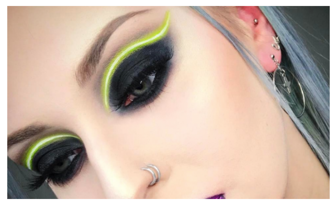
Electric Neon Eyeliner.

Neon Blue Eyeliner: This look, while seemingly complex, is very simple. Grab yourself a thick, white pencil and draw a wing starting in the outer corner of your eye and trace it into your crease. Then, using a pencil brush, trace the outside edges of the thick line you've created with neon blue eyeshadow — make sure to leave the center of the line white, to achieve the electric-effect.