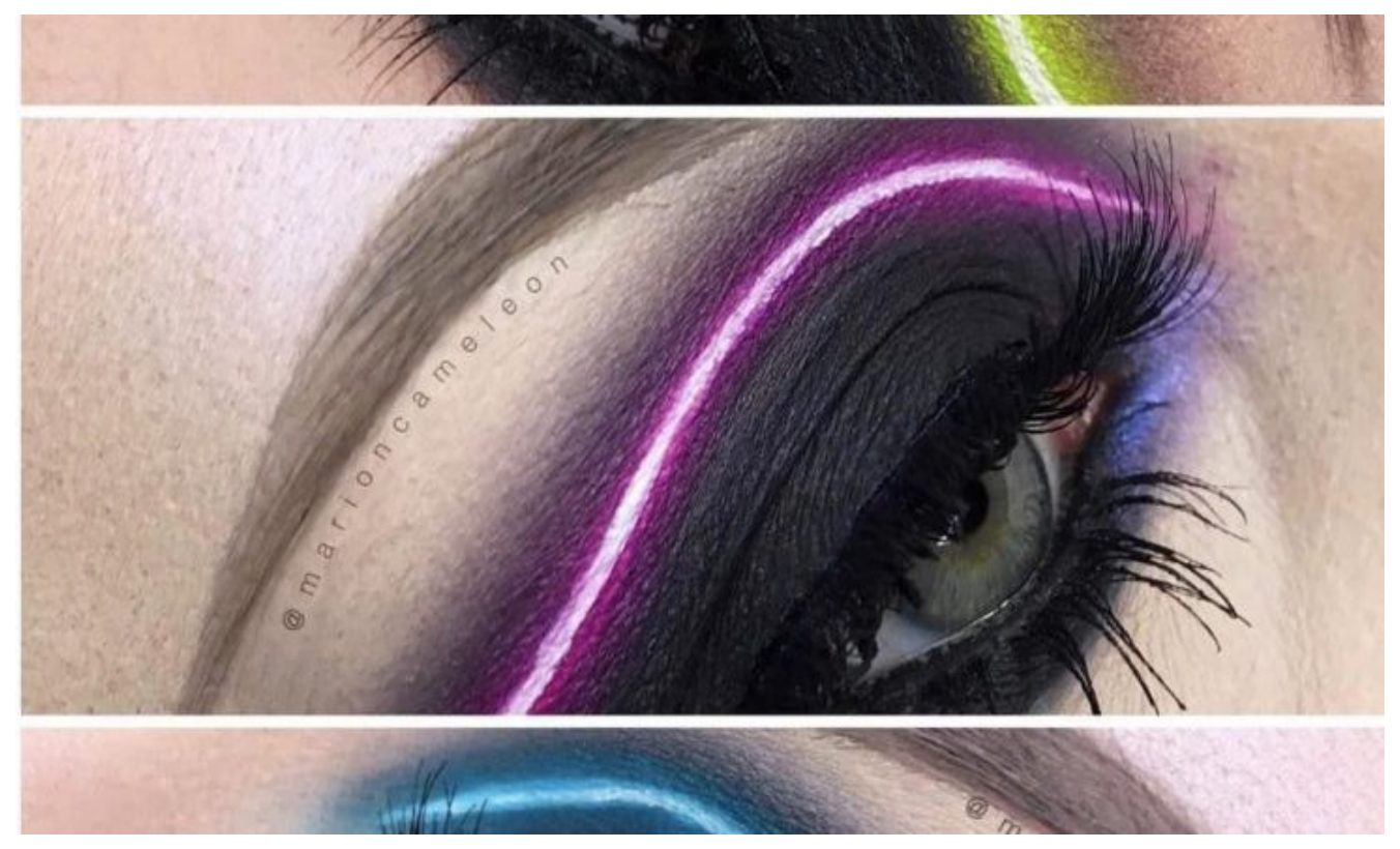
By Lauren Burczyk

When we think about wanting to make our eyes pop, we tend to strategically place highlighter in a way that will accentuate them. The newest beauty trend will literally make your eyes pop with color by sporting highlighter hues as liner. Neon eyeliner is the latest beauty trick to make your eyes more prominent. You've probably noticed some of these looks taking over your feeds and now we've brought you some of our favorites.