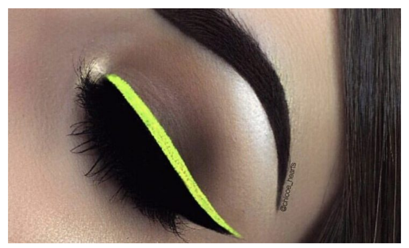
Neon Yellow Eyeliner.

Neon Yellow Eyeliner : This look may seem like it's very difficult to achieve, but if you have the right products, you'll nail it. Start off with a light smoky eye, trace on some white eyeliner, then top it off with neon yellow eyeliner to make it pop.