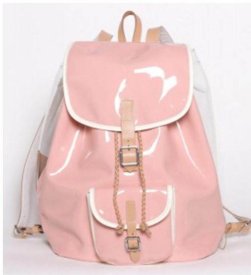
The Takashi bag by Harper Avenue.

In our exclusive author interview, the dating expert gives us a glimpse behind the evolution of clutch and reveals her best relationship advice about online dating and having the courage to find true love. And the best part? If you're still searching for the perfect gift this holiday season, the Takashi bag by Harper Avenue is a must-have holiday item. Use the discount code below for 20 percent off!